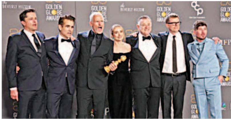
(L) The crew of “The Banshees of Inisherin” (M) Michelle Yeoh won Best Actress in a musical or comedy. (R) India won its first Golden Globe, in the Best Original Song category, for “Naatu Naatu” from “RRR”.