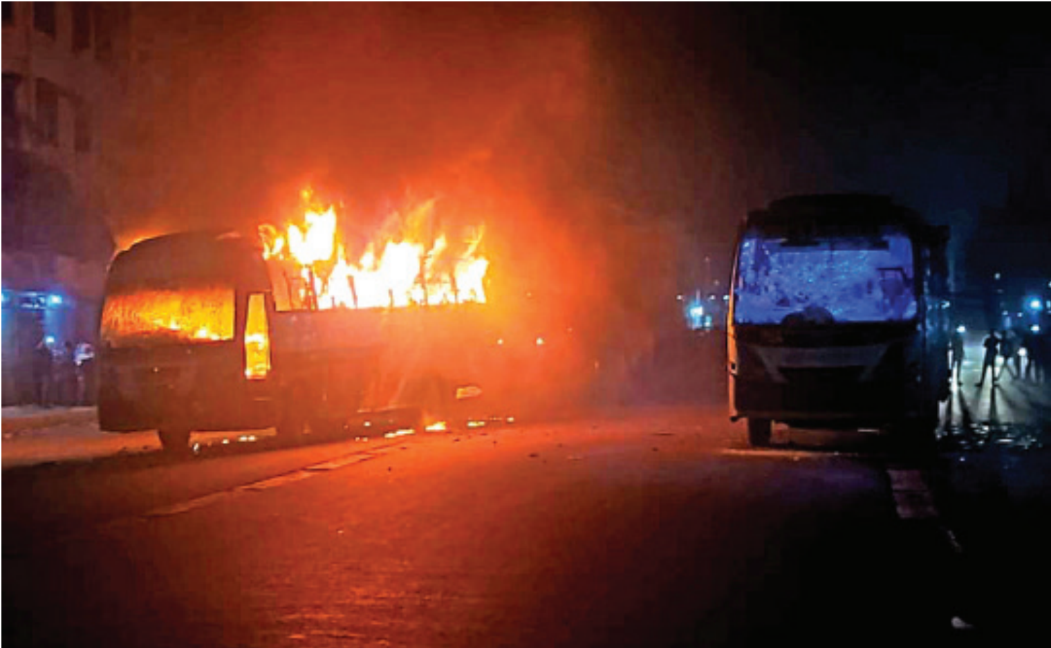
A bus was set ablaze by locals in Gazipur's Hariken area last night, after rumours spread that a woman and her grandson were killed in a road accident there. At least 20 vehicles were vandalised and six set on fire.