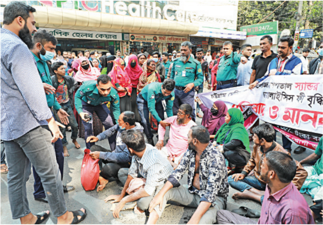
Police try to force kidney patients and their relatives off the road in front of Chattogram Medical College Hospital during a demonstration yesterday protesting the recent hike in dialysis fees. Cops later used batons to drive away the demonstrators. Story on page 2.