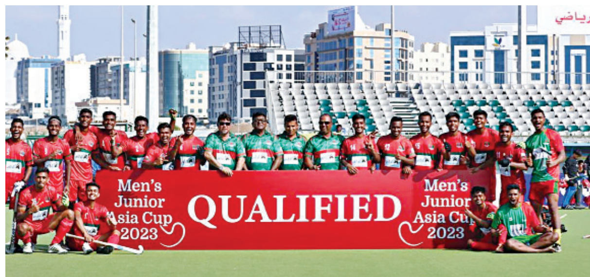
Bangladesh players stand with a placard reading 'Qualified' after reaching the semifinals of the Junior AHF Cup with a 6-1 win over Uzbekistan in their last Pool match, thereby confirming a berth in this year's Junior Asia Cup, at the Sultan Al Qaboos Stadium in Muscat yesterday. Bangladesh will take on Thailand in the first semifinal tomorrow.

For decades, the BHF had been struggling to hold the PHL regularly, either due to the obstacles from the clubs or the reluctance from the federation. As a consequence, the once prosperous hockey remains in dire straits as budding players keep losing their interest to aspire for excellence and, alarmingly, many resort to switching the profession merely for the sake of earning livelihood.