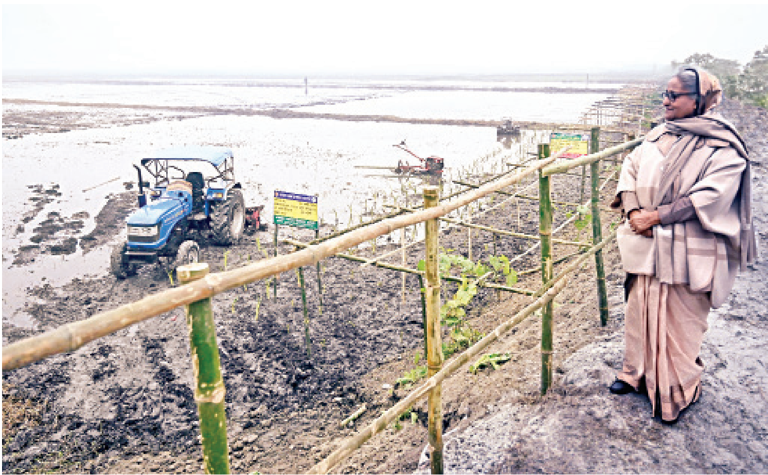
Prime Minister Sheikh Hasina visits Puber Beel in Gopalganj’s Tungipara early yesterday morning to see how vegetables and other crops are being cultivated there.