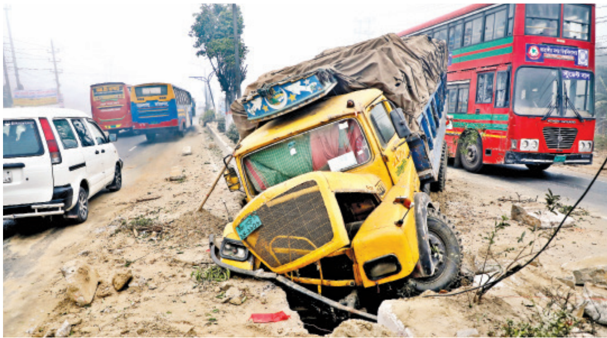
A truck crashes into a pit in the central reservation on Dhaka-Aricha highway in Savar’s Bank Town area early yesterday. Development work was going on at the central reservation there. An employee of the owner of the truck’s cargo said the driver, who was injured, did not see obstacles ahead due to poor visibility.