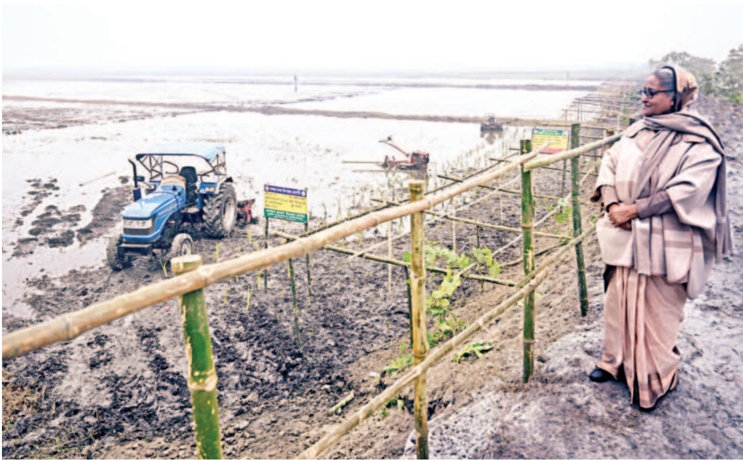
Prime Minister Sheikh Hasina visits Puber Beel in Gopalganj’s Tungipara early yesterday morning to see how vegetables and other crops are being cultivated there.