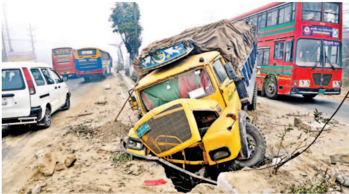
A truck crashes into a pit in the central reservation on Dhaka-Aricha highway in Savar’s Bank Town area early yesterday. Development work was going on at the central reservation there. An employee of the owner of the truck’s cargo said the driver, who was injured, did not see obstacles ahead due to poor visibility.