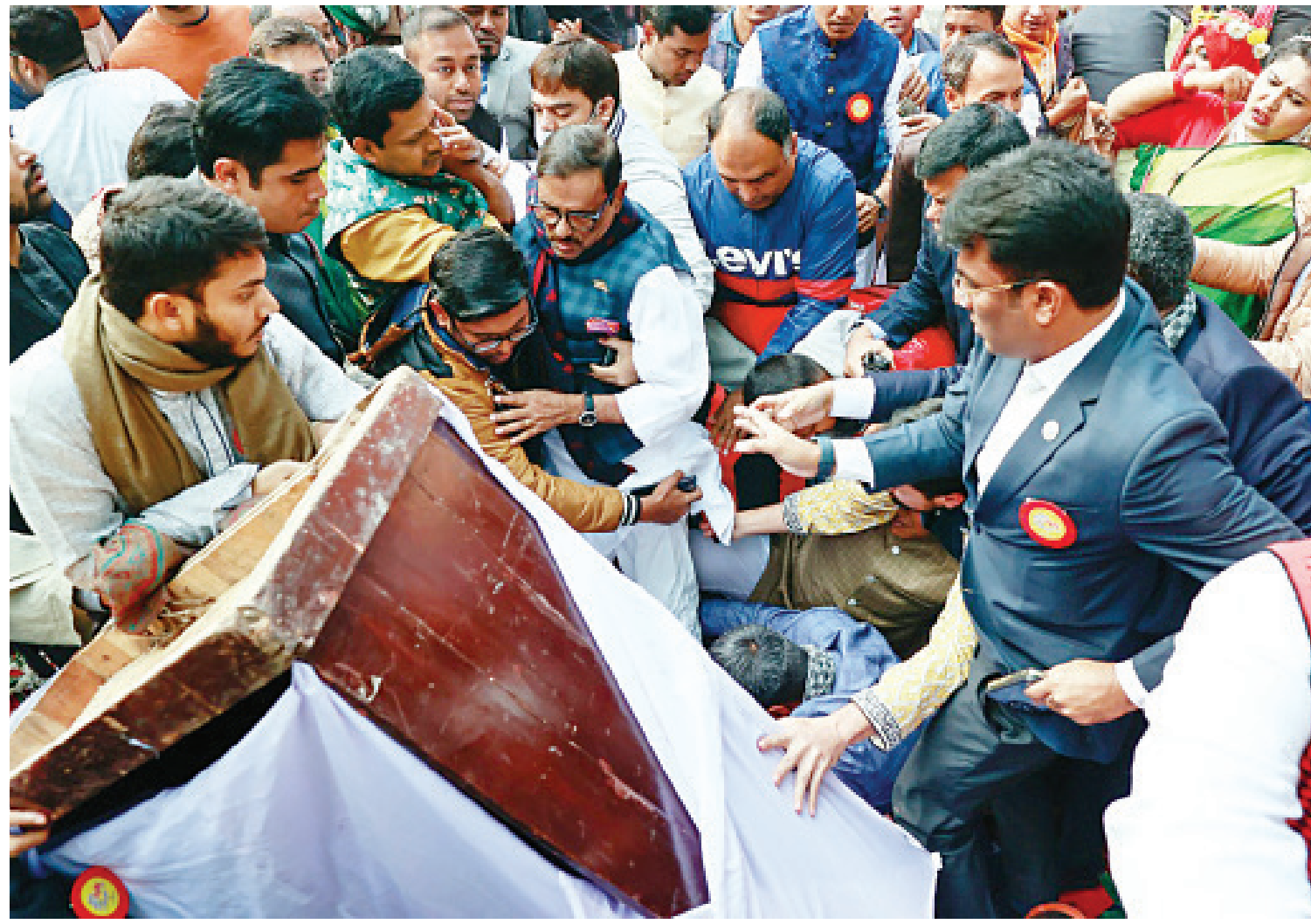
Chhatra League leaders helping Awami League General Secretary Obaidul Quader get back on his feet moments after a stage collapsed near Oporajeyo Bangla on Dhaka University campus yesterday afternoon. Quader was addressing the event, organised on the occasion of BCL's 75th founding anniversary, when the mishap took place. The 71-year-old road transport and bridges minister was unhurt.