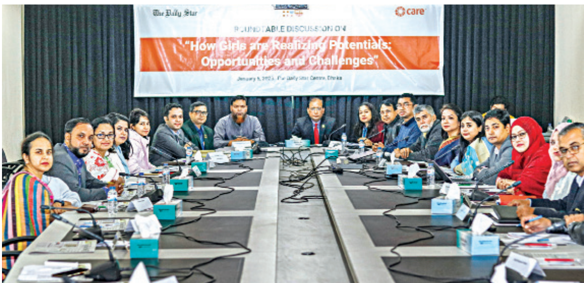
Speakers at the roundtable titled, "How girls are realising potentials: Opportunities and Challenges", jointly organised by Care Bangladesh and UNFPA, in association with The Daily Star at the capital's The Daily Star Centre yesterday.