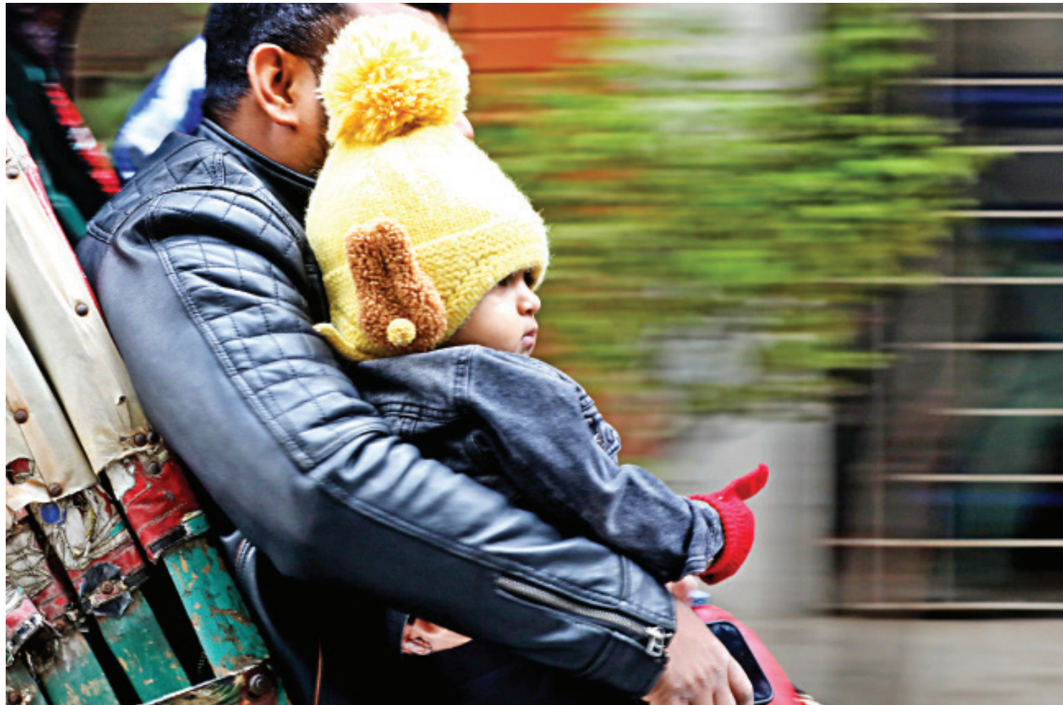
A child covered in layers of warm clothes, including a beanie with ear-flaps and gloves, takes a ride on a rickshaw with the guardian in the capital's Mohammadpur area. With the cold wave sweeping across the country, temperatures have gone down to an almost unbearable extent. This photo was taken yesterday.

He also said they would let the court know about this matter.