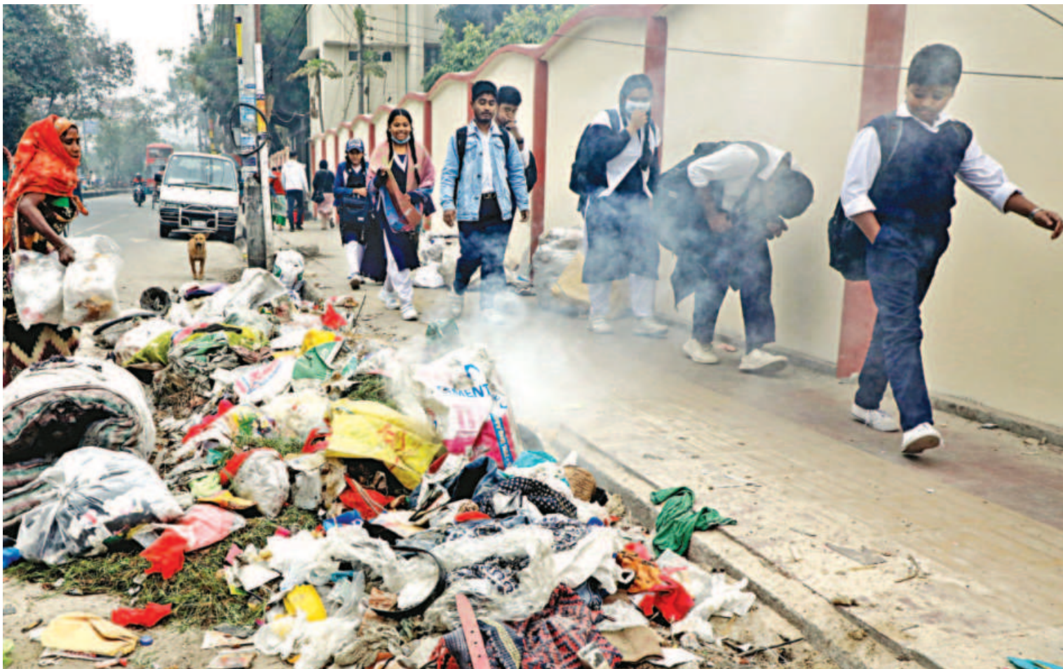
A schoolboy is bent double from coughing, while his fellow students are trying to swerve away from the smoke emitting from a burning pile of garbage near a footpath in the capital's Satmasjid road yesterday noon. Not only is the road littered with open garbage, the trash is set on fire, releasing toxic smoke into the air. However, the authorities concerned seem to remain oblivious towards the harm such acts cause to the environment and the people.