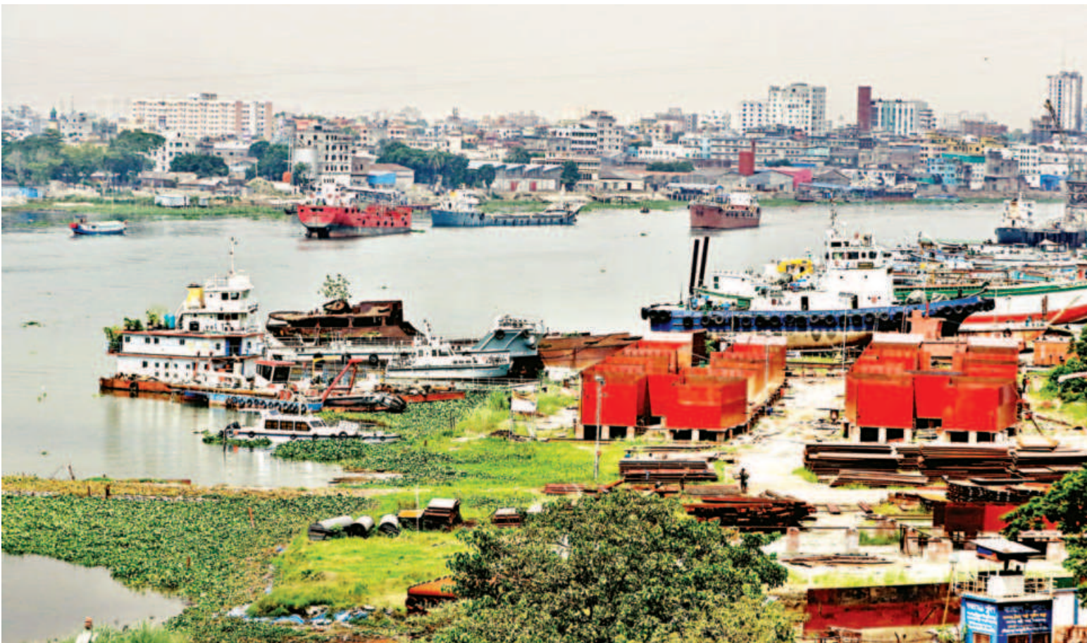
Encroachment on the Shitalakkhya has narrowed the river in Bandar area of Narayanganj city. The grabbers have illegally set up dockyards and different other businesses on the land.