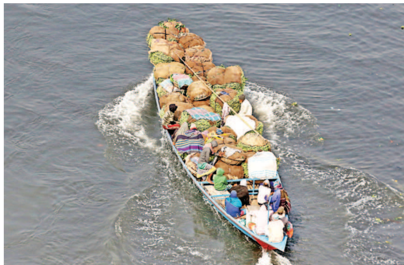
A boat packed with freshly harvested winter vegetables entering the capital via the Buriganga from Munshiganj. Every year winter comes as a delight for food lovers as vegetables flood the city markets. Even all-season vegetables tend to drop in prices during this season. The photo was taken in the capital's Postogola yesterday.