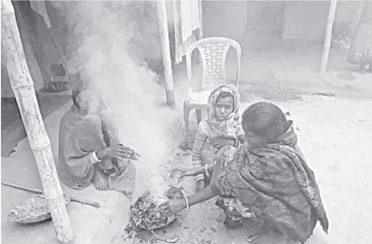
A few women at Kanihati Tea Garden Colony in Moulvibazar's Kamalganj upazila are trying to save themselves from the bone-chilling cold by making fires with straw and tree stems.