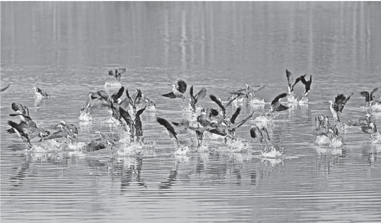
WINTER IS HERE, SO ARE THE GUESTS... Flocks of migratory birds have started arriving at the ponds and lakes of the country as the countryside is sparkling in morning dew, announcing the arrival of winter. And the Laskar Dighi of Chattogram's Raozan is no different. This photo was taken recently.