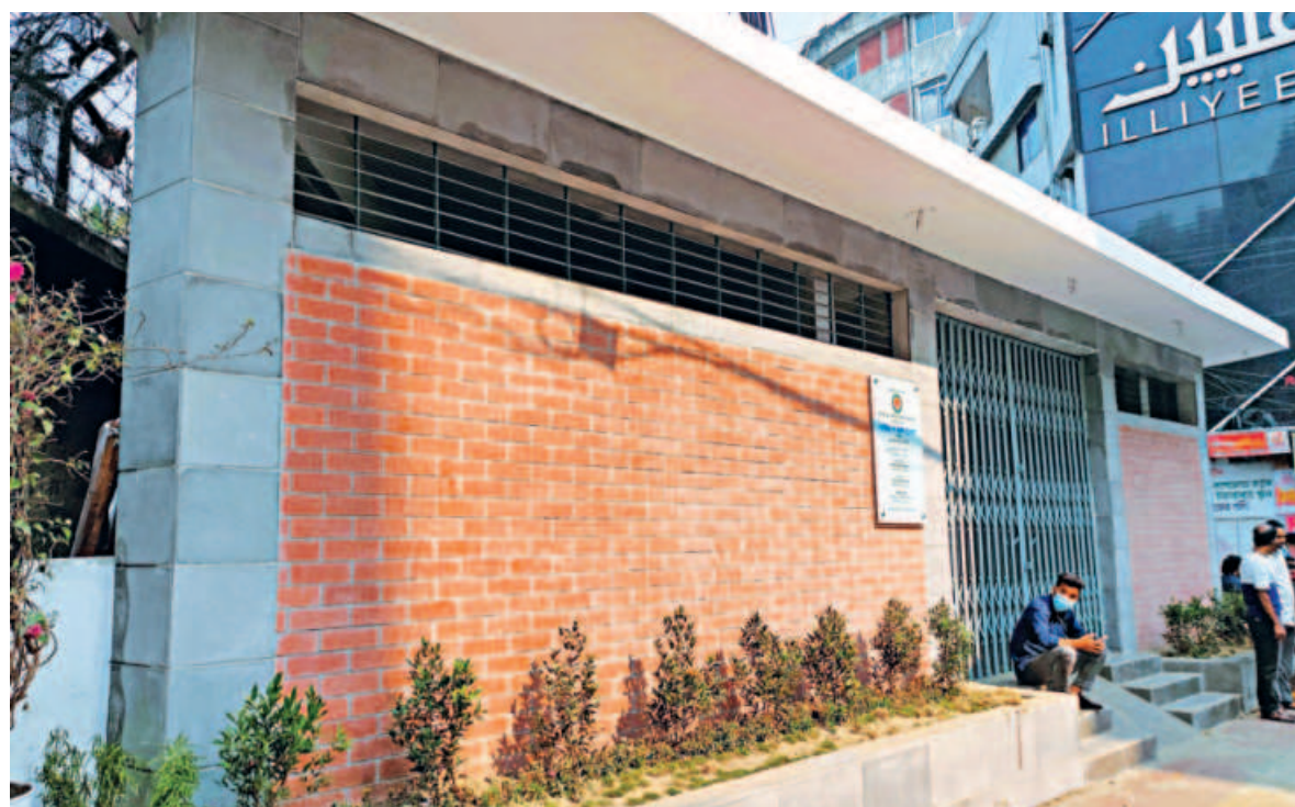
This brand new public toilet on the capital's Elephant Road was inaugurated on November 30, but due to complications centring the leasing process, according to officials, the facility has remained closed to the public. Those visiting the area are still resorting to using toilets at nearby markets and mosques, which are usually not suitable for use.