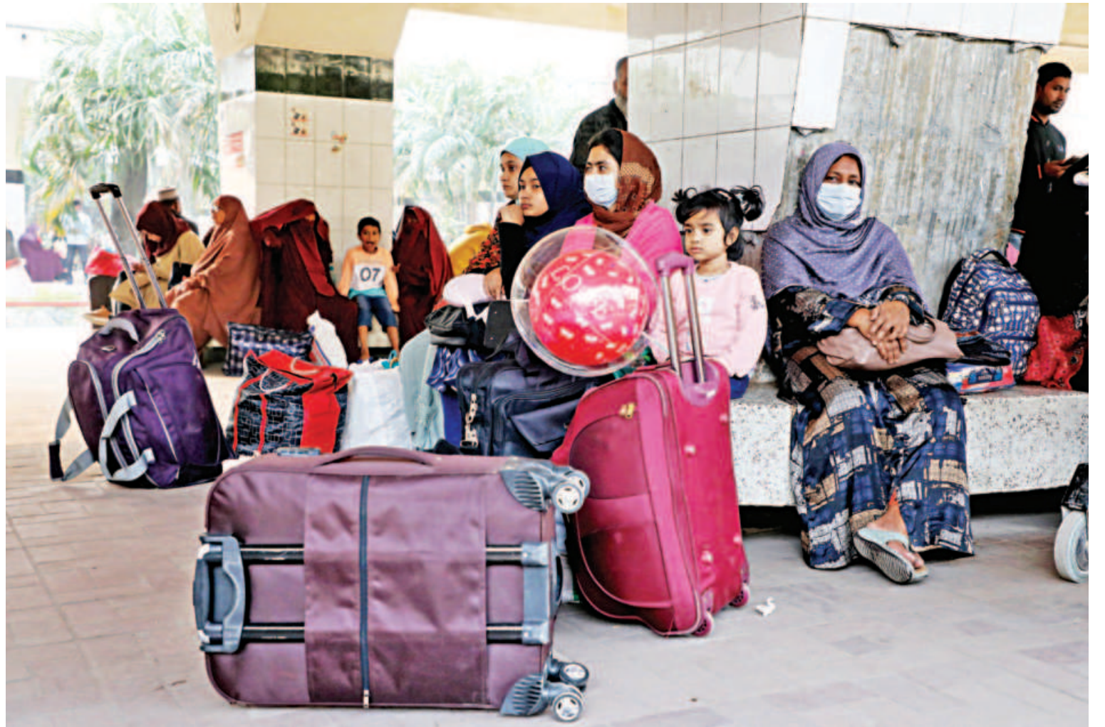
Due to the dense morning fog, many trains were behind schedule yesterday. And so, scores of people were seen sitting at the same place for hours, with luggage by their side, at Kamalapur Railway Station, waiting to finally board their ride.