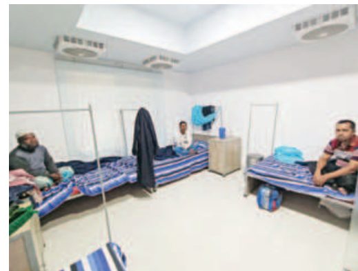
The Bangabandhu Wage Earners Center was established on 8,470 acres of land near Dhaka airport so that workers who are set to leave the country can have a place to stay for a few days before boarding their flight. However, due to a lack of promotion, many expatriate workers are unaware of the facility. These photos were taken recently.