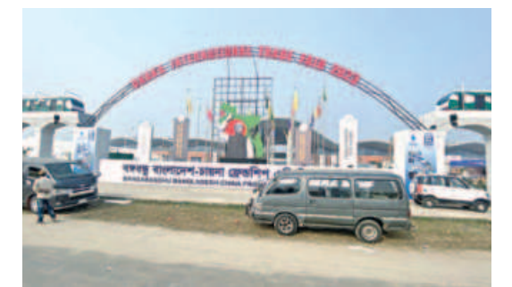
The new venue of the Dhaka International Trade Fair at Purbachal.

Meanwhile, Bangladesh Road Transport Corporation has introduced 50 shuttle buses to carry passengers between Kuril and the venue of the trade fair.