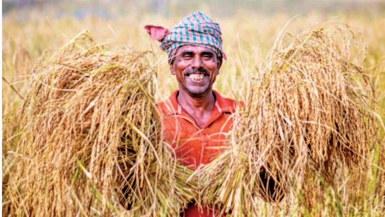
CROPS OF GOLD ... A farmer smiles ear to ear, ecstatic with his Aman yield this year in Tentultala beel of Khulna's Batiaghata upazila. Farmers across the upazila have been busy gathering the crop and till yesterday, at least 70% of all the Aman paddy on 93,185 hectares of agricultural fields in Khulna has already been harvested.

In the year 2020, when Covid-19 had the world in its deadly grip, forcing the country to opt for lockdown and bringing the economy to a standstill, it was the farmers who still went out to their fields and worked relentlessly to keep the flow of food steady for the nation.