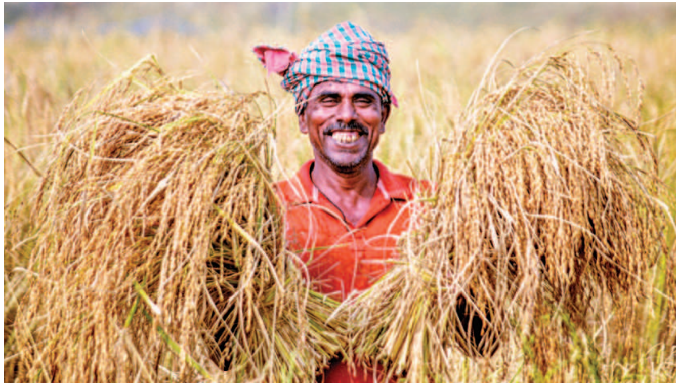
CROPS OF GOLD ... A farmer smiles ear to ear, evidently ecstatic with his Aman yield this year in Tentultala beel of Khulna's Batiaghata upazila. Farmers across the upazila have been busy gathering the crop and till yesterday, at least 70% of all the Aman paddy on 93,185 hectares of agricultural fields in Khulna has already been harvested.

In the year 2020, when Covid-19 had the world in its deadly grip, forcing the country to opt for lockdown and bringing the economy to a standstill, it was the farmers who still went out to their fields and worked relentlessly to keep the flow of food steady for the nation.