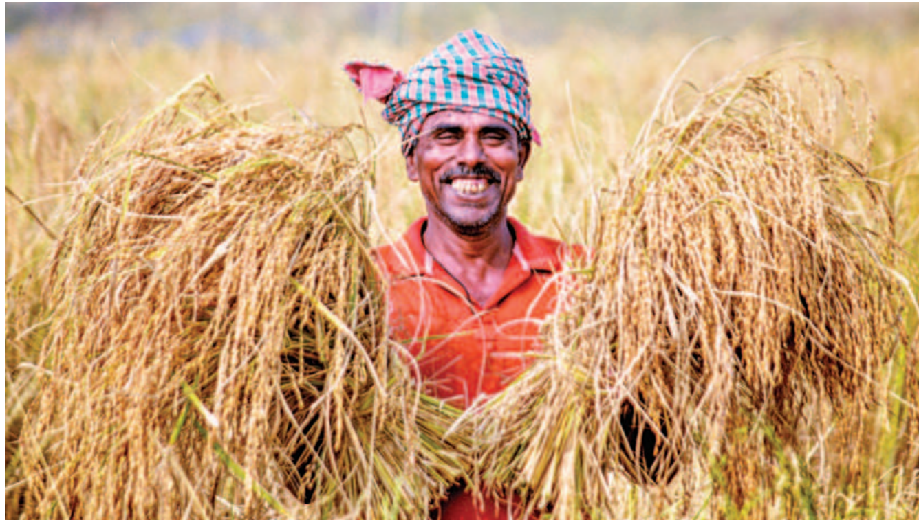
CROPS OF GOLD ... A farmer smiles ear to ear, ecstatic with his Aman yield this year in Tentultala beel of Khulna's Batiaghata upazila. Farmers across the upazila have been busy gathering the crop lately, and till yesterday, at least 70% of all the Aman paddy on 93,185 hectares of agricultural fields in Khulna was harvested.

In the year 2020, when Covid-19 had the world in its deadly grip, forcing the country to opt for lockdown and bringing the economy to a standstill, it was the farmers who still went out to their fields and worked relentlessly to keep the flow of food steady for the nation.