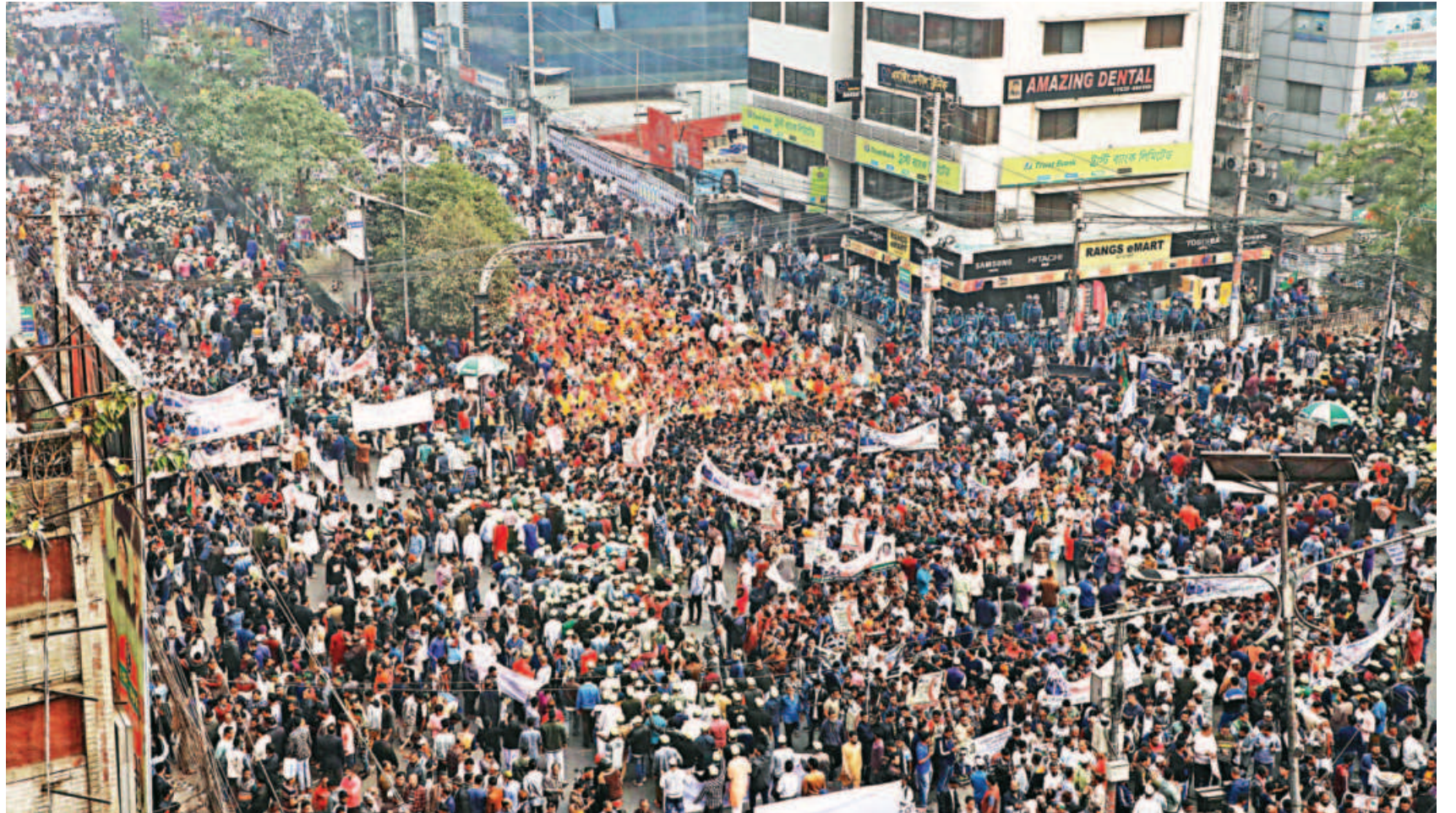
Men and women wearing brightly-coloured outfits stand out among thousands of BNP supporters as they march through the Nightingale intersection in Bijoy Nagar yesterday. The organisers held a brief rally in front of BNP's Nayapaltan office before they started marching towards towards Moghbazar.