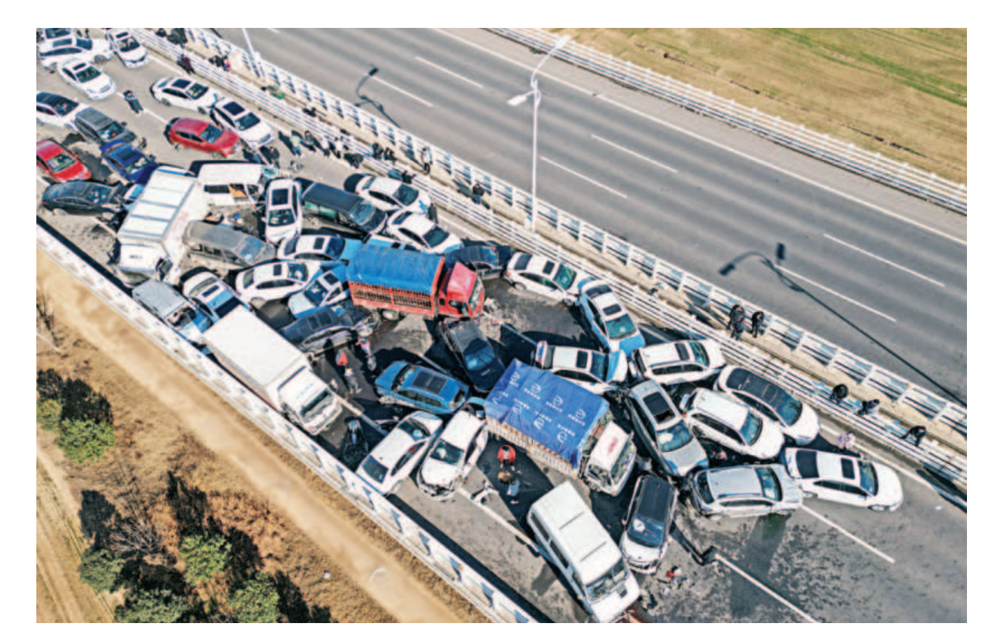
This aerial photo taken yesterday shows a multi-vehicle collision on Zhengxin Yellow River Bridge in Zhengzhou, in China's central Henan province. One person died during the highway pile-up.

The situation was expected to change dramatically. The NWS forecast a rapid thaw later this week, with spring-like temperatures well above freezing and well above normal, accompanied by rain that could unleash flooding.