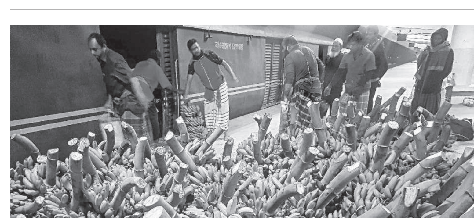
Bananas from Jashore-Chuadanga region have their own demand in Khulna. Wholesalers bring them in lots on trains, store them in their warehouses and later sell them when they ripe. The photo was taken at Khulna Railway Station recently.