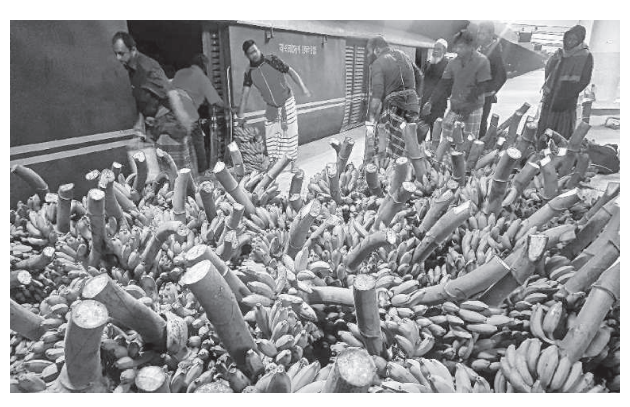
Bananas from Jashore-Chuadanga region have their own demand in Khulna. Wholesalers bring them in lots on trains, store them in their warehouses and later sell them when they ripe. The photo was taken at Khulna Railway Station recently.

His friends also ordered refund the money, he said.