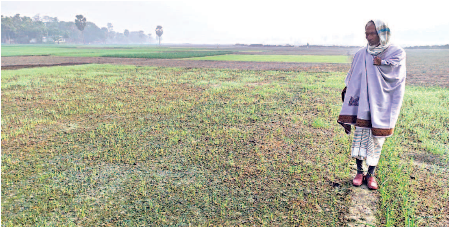
Rather than vast swathes of onion saplings, farmers like this one in Khoargram village under Pabna's Saltha upazila have been left staring at empty fields as the poor quality of seeds available in local markets is seriously hampering production of the bulb this year.