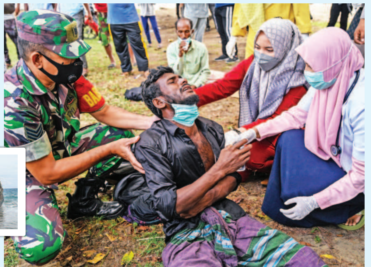
Health workers check a Rohingya refugee who was feeling sick after his arrival by boat in Krueg Raya, Indonesia's Aceh province, yesterday.

The UNHCR said last week that it has been in the water since late November, and it had received reports of at least a dozen people dying on board. Those left on the boat have no access to food or water.