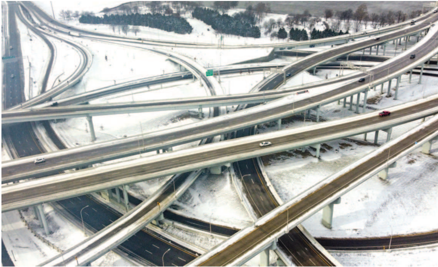
Vehicles move along a highway in Louisville, Kentucky, under freezing temperatures. A fearsome winter storm continued to pummel parts of the United States with blizzard conditions Saturday evening after powerful Arctic winds left over a million customers without power earlier in the day and caused Christmas travel nightmares. At least 17 weather-related deaths have been confirmed across eight states.