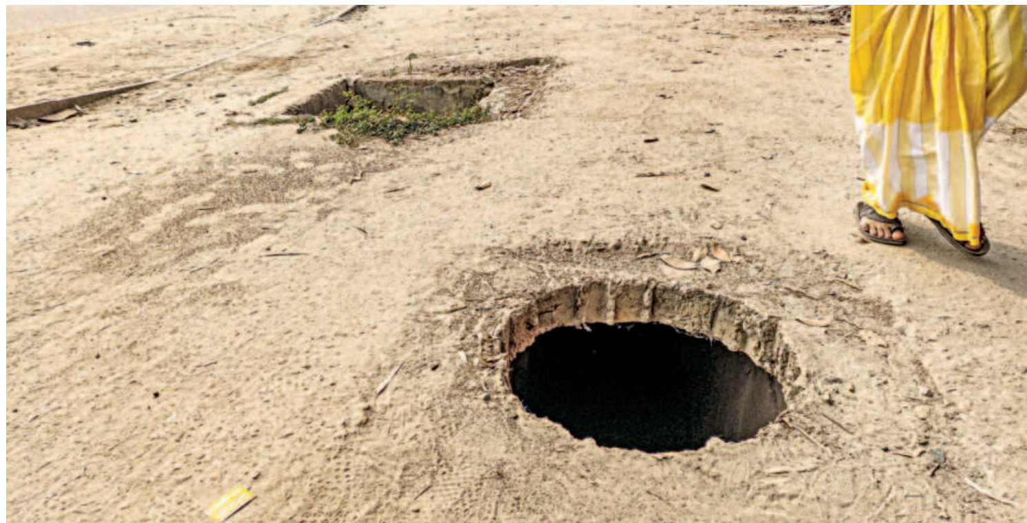
There are several lidless manholes on the entire stretch of the road from Agargaon Shishu Mela to Sher-e-Bangla Nagar area. Several pedestrians have injured themselves by falling into these holes in the last few months, locals claimed. The risks get worse during the night. This photo was taken from Agargaon yesterday.

The total number of recoveries now stands at 19,87,297 and the recovery rate stands at 97.56 percent, said the release.