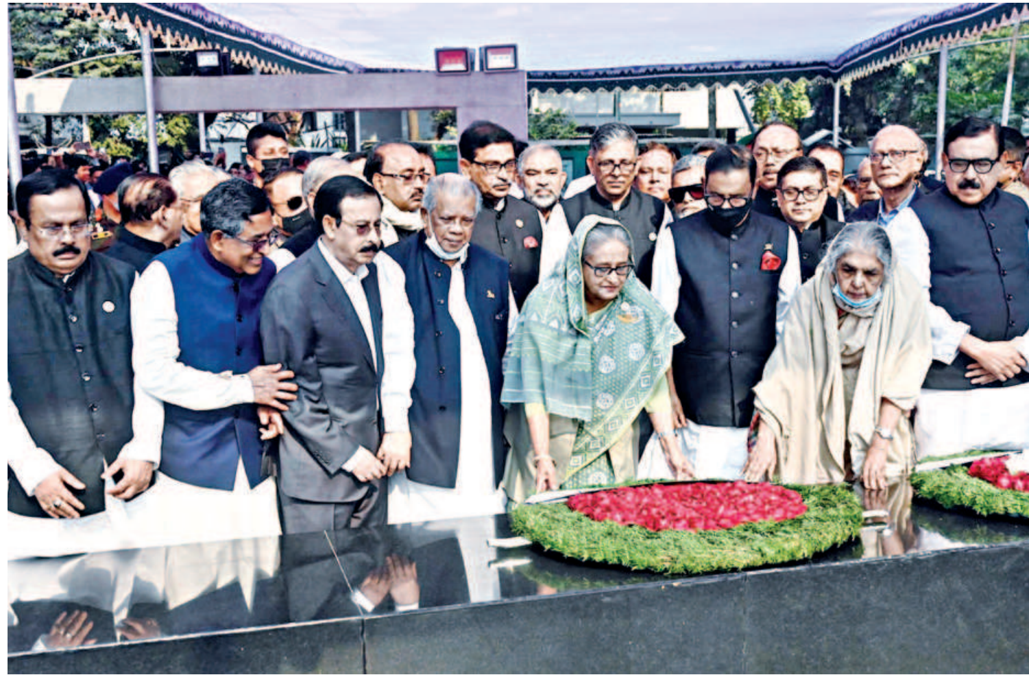
Awami League President and Prime Minister Sheikh Hasina along with the newly-elected AL central working committee and advisory council members paid rich tributes to Father of the Nation Bangabandhu Sheikh Mujibur Rahman by placing a wreath the portrait of Bangabandhu in front of the Bangabandhu Memorial Museum at Dhanmondi-32 yesterday morning.

Archbishop of Bangladesh, ambassadors and representatives from foreign missions, distinguished members of the Christian community, religious leaders and professionals will join the reception.