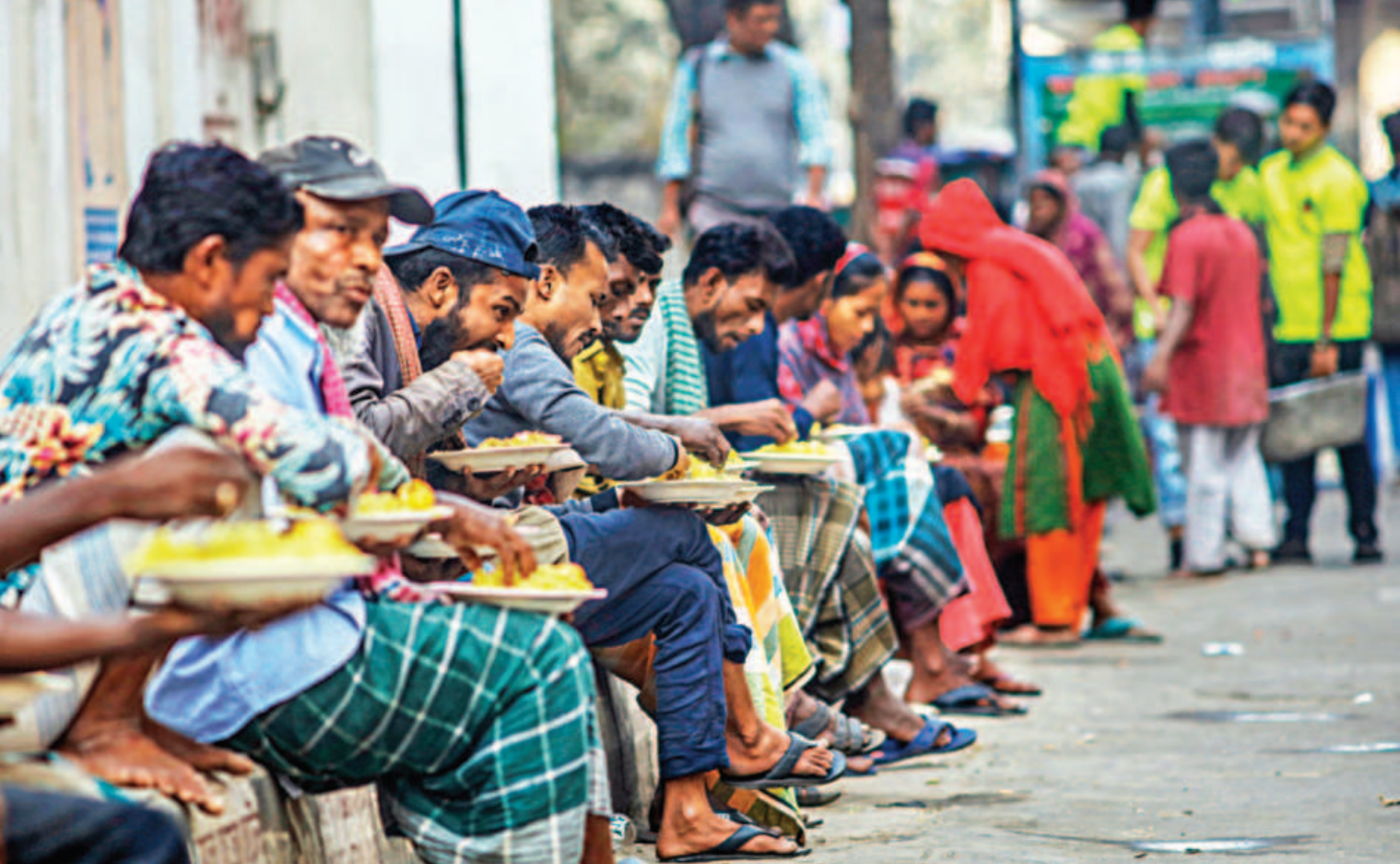
BHALO KAAJER HOTEL (MEAL FOR A GOOD DEED)... Dozens of people were sitting on the footpath and enjoying their afternoon meal -- khichuri with egg curry -- at this strange “restaurant” that does not charge customers. One simply needs to do one good deed a day to get food from here. The place mainly provides food to those afflicted with poverty, who cannot afford three square meals a day. This photo was taken in Tejgaon area yesterday.