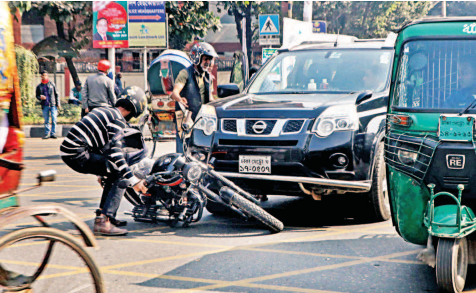
Saving a few minutes is more important to this biker than his own safety as he was driving on the wrong side of the road to avoid the gridlock on the other side. As a result, a car coming from the opposite direction bumped into the motorcycle slightly. A serious accident was avoided and the rider was left with only a few scratches, as the car managed to hit the brakes right at the last second. This photo was taken in Shikha Bhaban area yesterday.