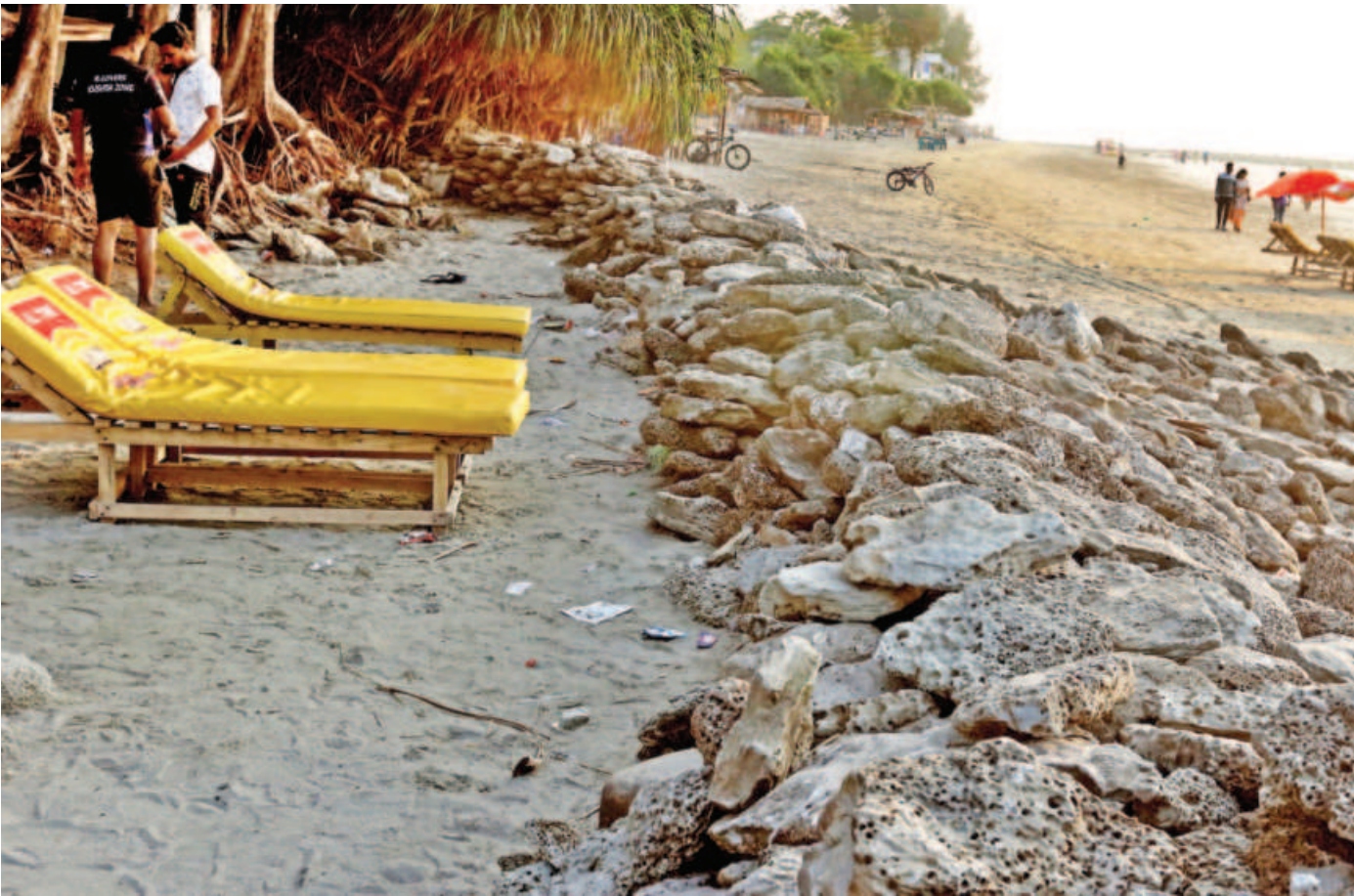
Chunks of coral have been used to build an embankment of sorts in front of a hotel on the beach at Saint Martin's island. Local businesses do this all over the beach as the Department of Environment takes no action to protect the island that exists because of its coral base. The photo was taken recently.