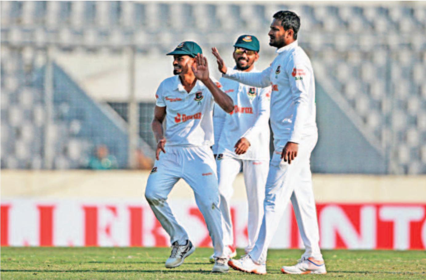
Shakib Al Hasan (R) is congratulated by Taijul Islam (L) as Mominul Haque joins them following the dismissal of an India batter on the second day of the second Test at the Sher-e-Bangla National Stadium in Mirpur yesterday. The two left-arm spinners shared eight wickets to pull Bangladesh back into the game.