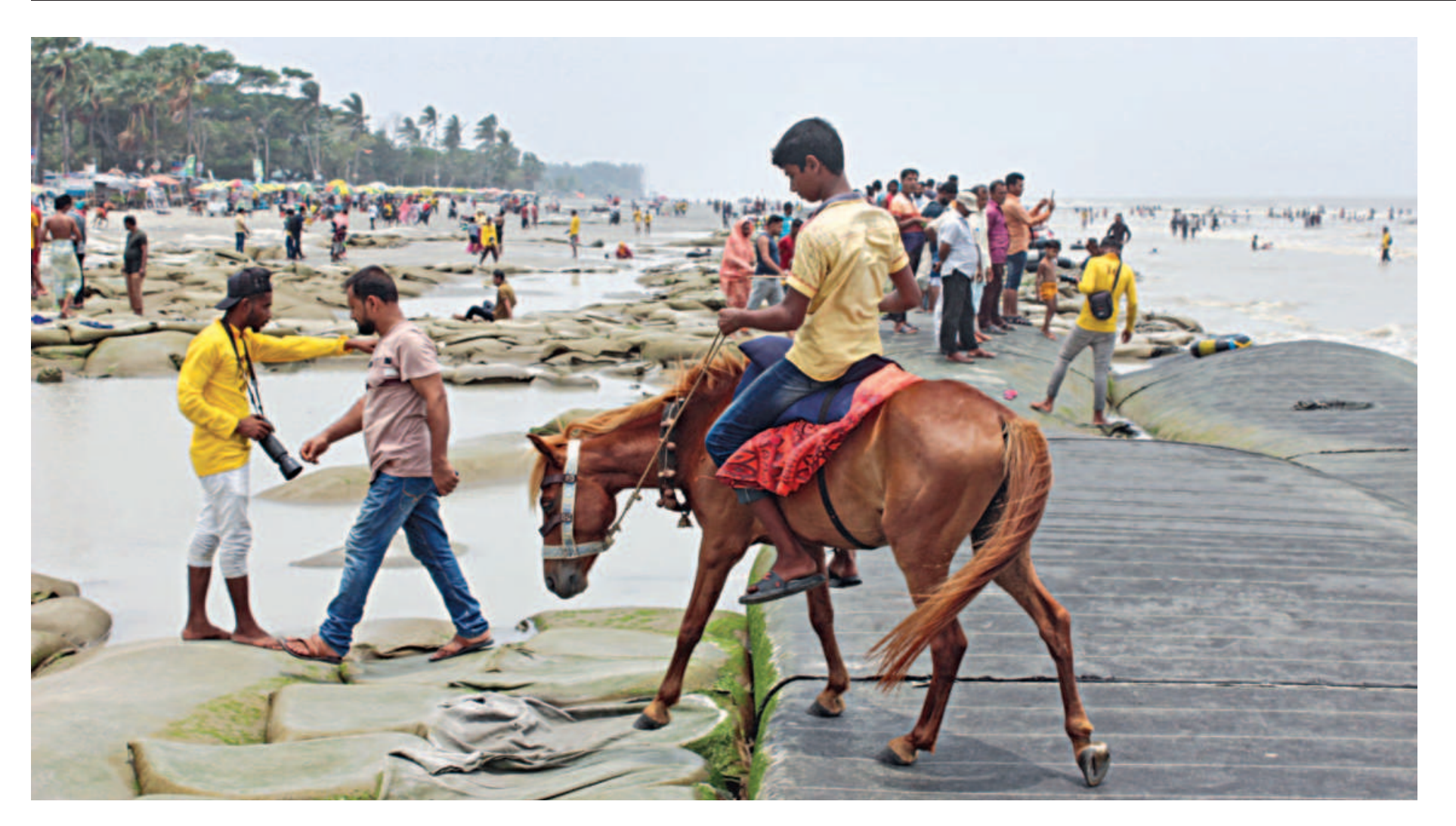
Many people are visiting Kuakata in Patuakhali to have a break from the hustle and bustle of city life as it is a rare place to enjoy the sunrise and sunset, making it a very popular tourist destination.