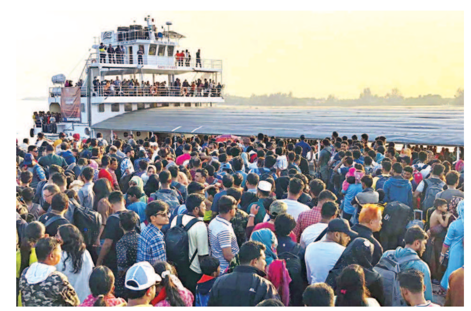
Hundreds of holidaymakers waiting to get on board an already-crowded small ship on Saint Martin's Island yesterday afternoon. Some of the vessels that operate between Cox's Bazar and the island went out of order two days ago, leaving many tourists stranded.