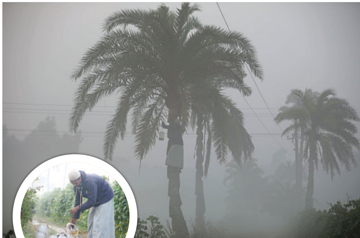
This is the season for date palm juice -- a tasty winter delicacy and a key ingredient in many rice cakes. So, braving the chilly winter mornings, date palm juice collectors get busy extracting the sweet nectar. The photos were taken recently in Purba Syedpur of Chattogram's Sitakunda upazila.