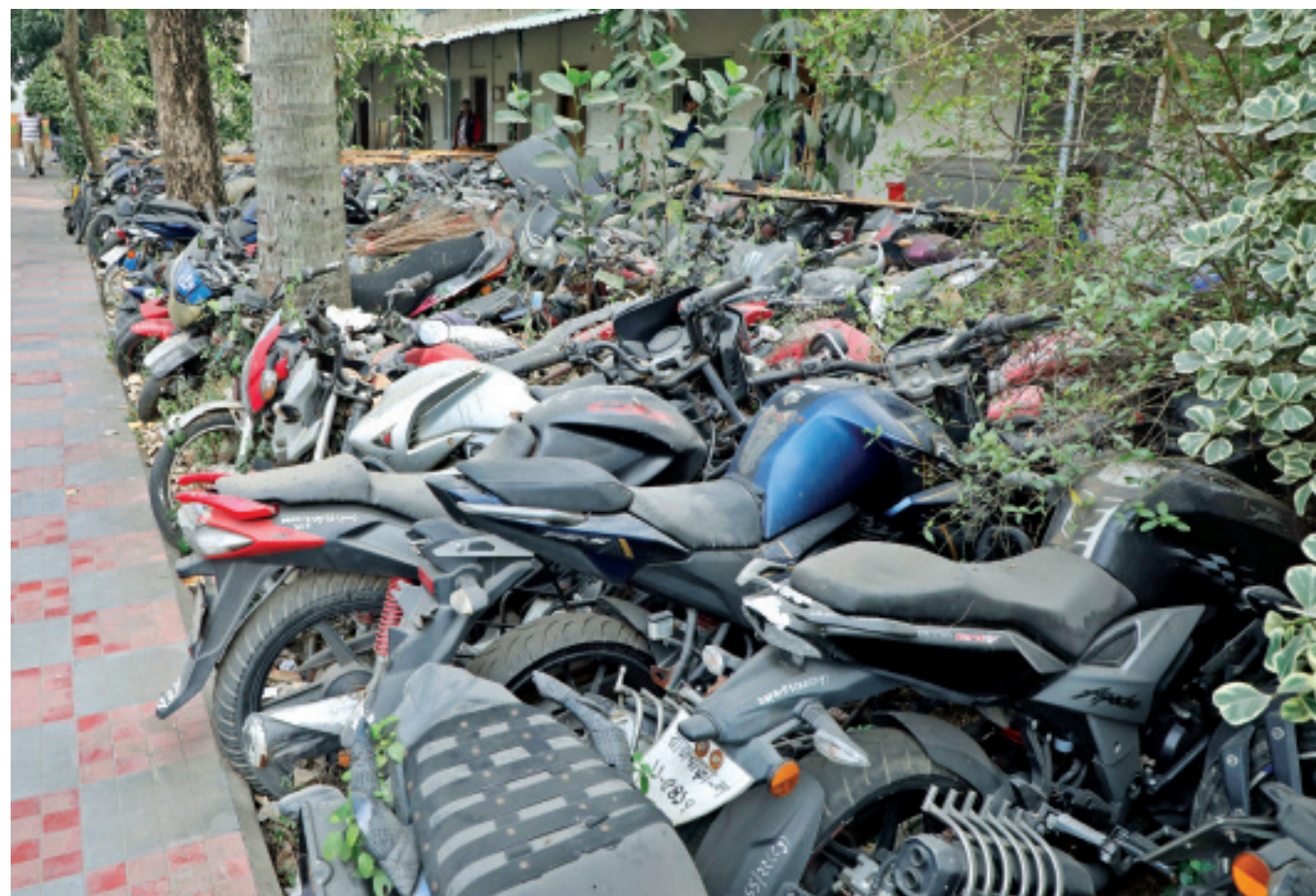
Motorcycles, confiscated by the law enforcers on different charges, left to decay on the premises of DB office in the capital. Apparently, no step is being taken to utilise these assets. The photo was taken recently.

The largest increase in coal demand is expected to be in India at 7 percent, followed by the European Union at 6 percent and China at 0.4 percent. "The world is close to a peak in fossil fuel use, with coal set to be the first to decline, but we are not there yet," said Keisuke Sadamori, the IEA's director of energy markets and security.