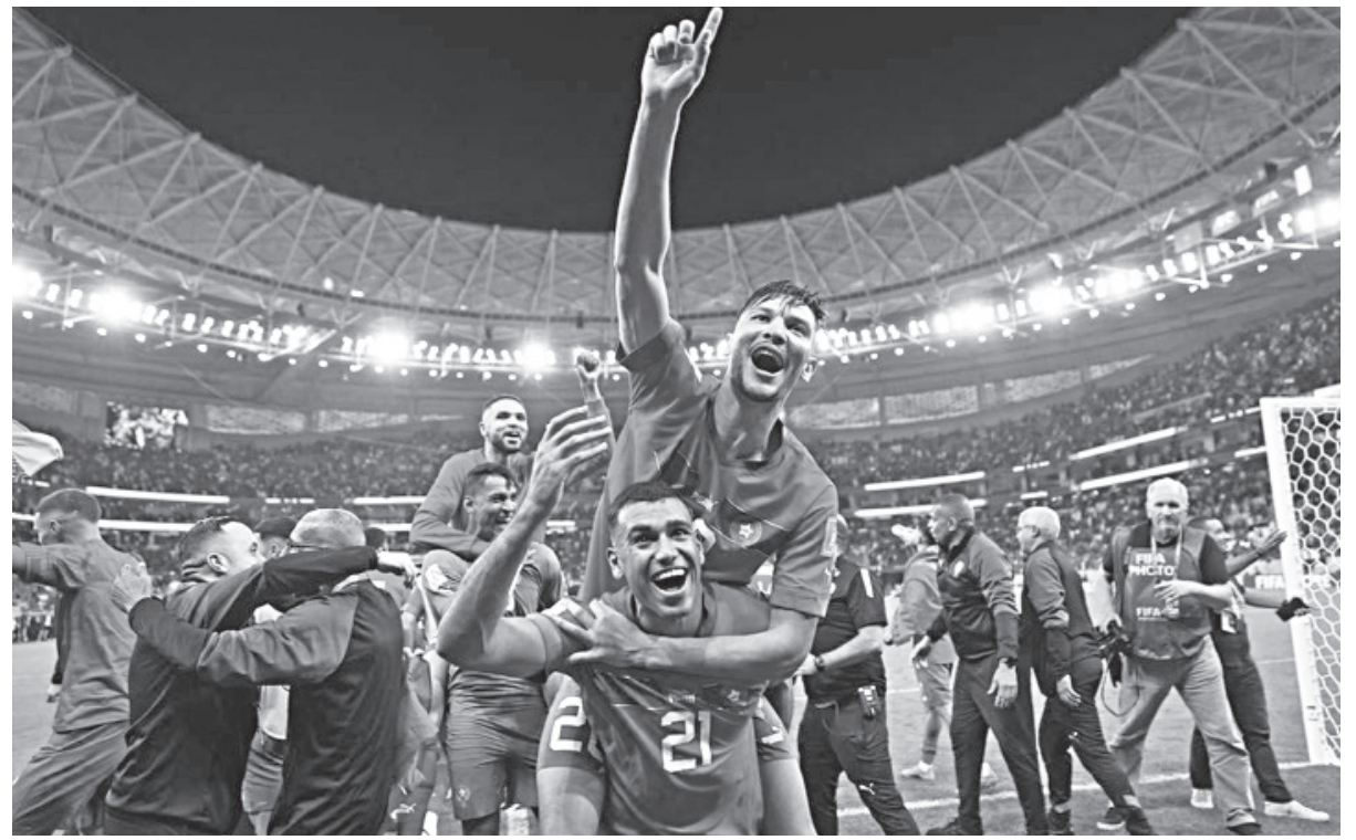
Morocco’s success in the football World Cup was not a fluke.

To create liveable cities, it is very important to come down from the sky and wade into the mud of our grinding reality on the ground. Ministers, city mayors, MPs, bureaucrats, city administrators, transportation engineers, and planning professionals should start walking on the footpaths – at least a kilometre of it – to reach their office every day. Change comes when one experiences its possibilities.