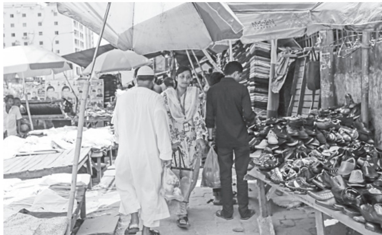
In Bangladesh, we hardly value walkable footpaths as part of our urban ecosystem.

If that is the case, why should the story of non-European and non-South American success in the World Cup be so limited? It’s clear that Morocco have found their method, their way forward, and football’s universality and global appeal – as a sport and not a business – ensures that other nations will, too.