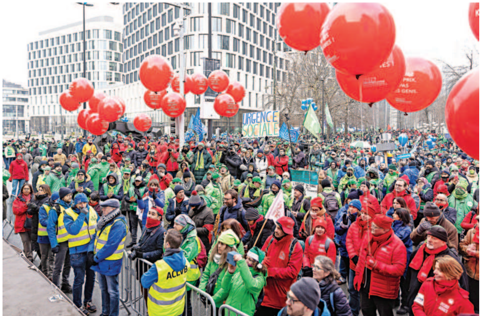
Protestors gather during a national demonstration to demand more measures against the rising cost of living, organized by the three national trade unions, in Brussels, Belgium yesterday.

Pakistan this week accused India of backing militants responsible for the 2021 bombing in Lahore near the house of an Islamist leader which killed four people.