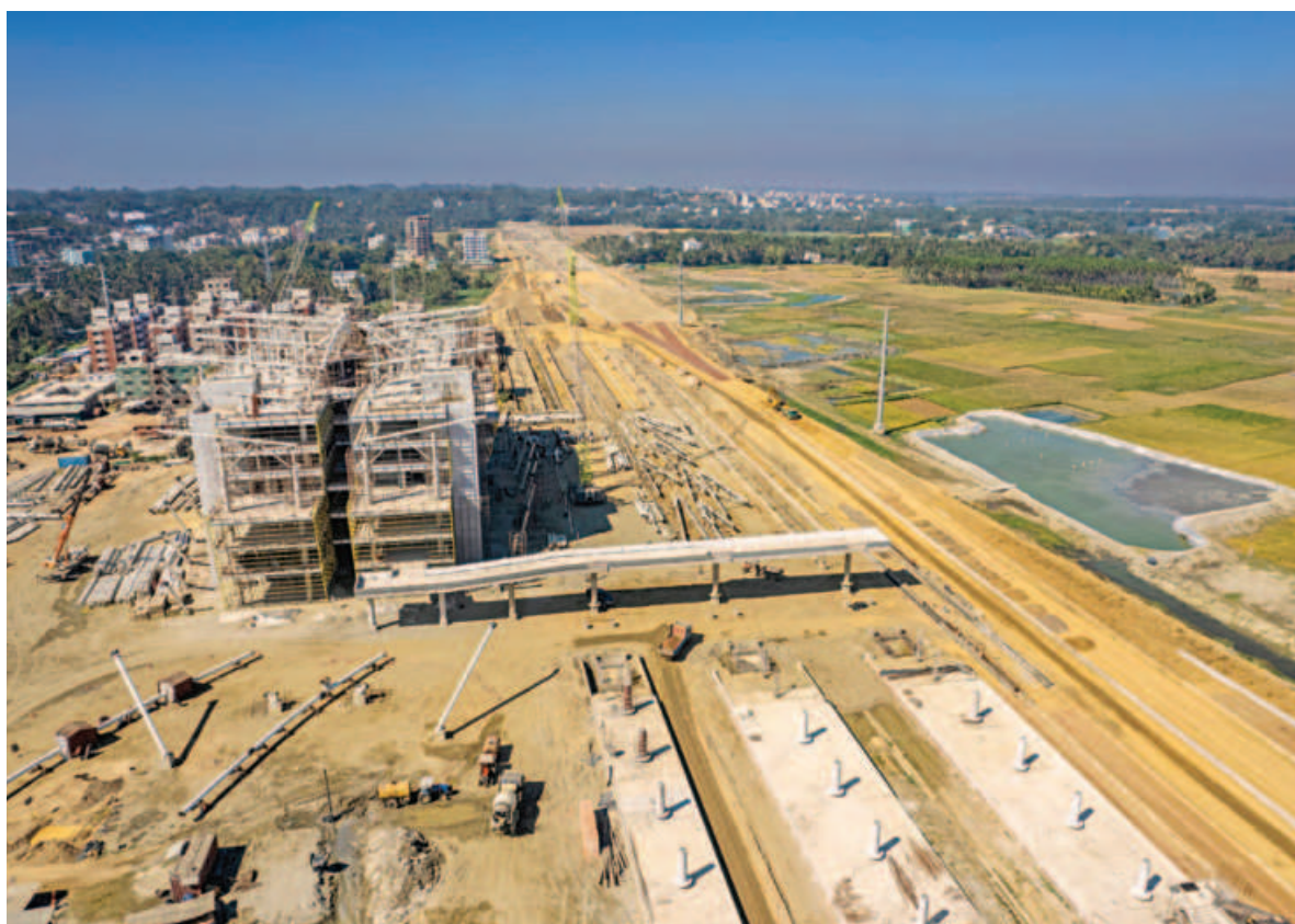
The construction of an iconic railway station in Ramu upazila of Cox's Bazar has been going on in full swing. Once built, the oyster-shaped station on 29 acres of land will connect the district with Chattogram and the rest of the country. The photo was taken in Ramu's Chanderpara area recently.