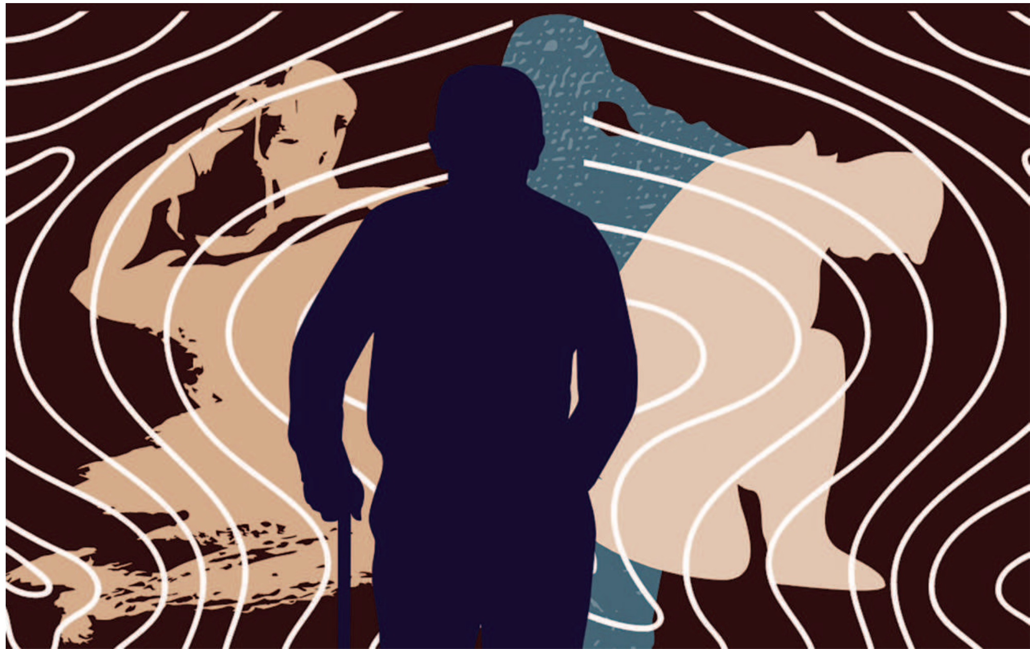
ILLUSTRATION: SYEDA AFRIN TARANNUM