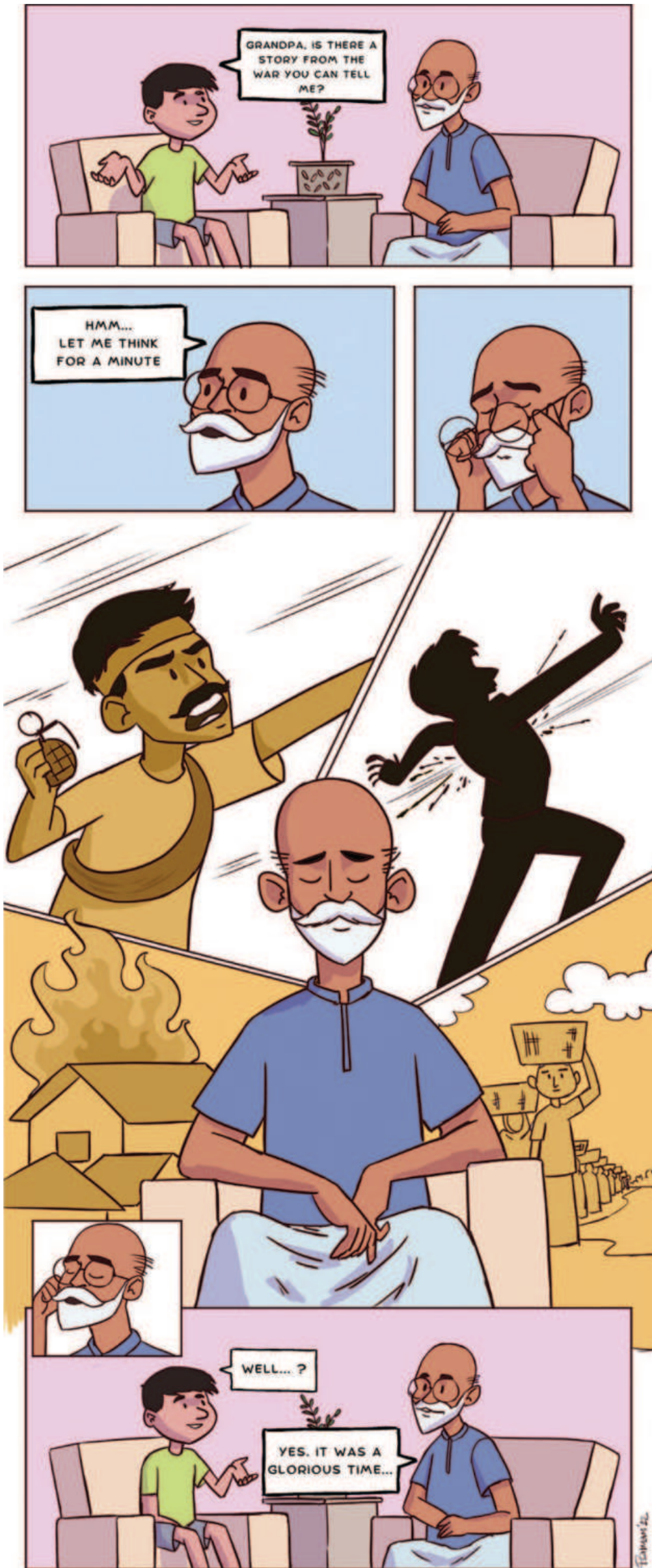
ILLUSTRATION: JUNAID IQBAL ISHMAM