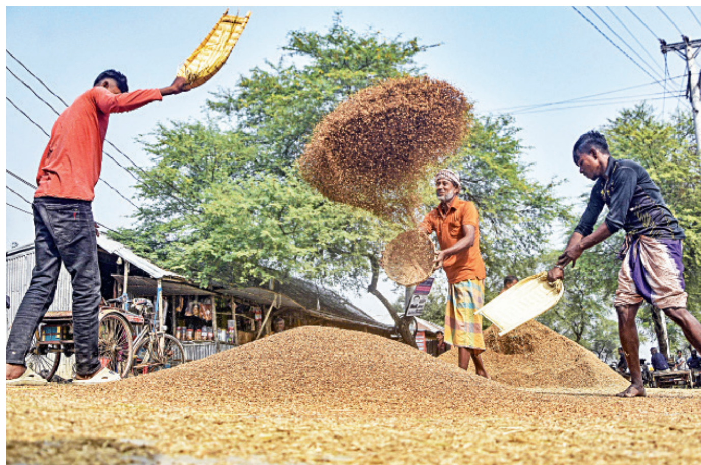
Farmers winnowing their Aman grains in Khulna's Batiaghar Bazar yesterday. The grains can be sold at Tk 1,500 per maund. According to the DAE, Aman is cultivated on at least 83,185 hectares of land in the district. At least 30 percent of it has been harvested till December 14.

In addition, the gap between humanitarian needs and its financing has grown to a global deficit of $27 billion as of November 2022.