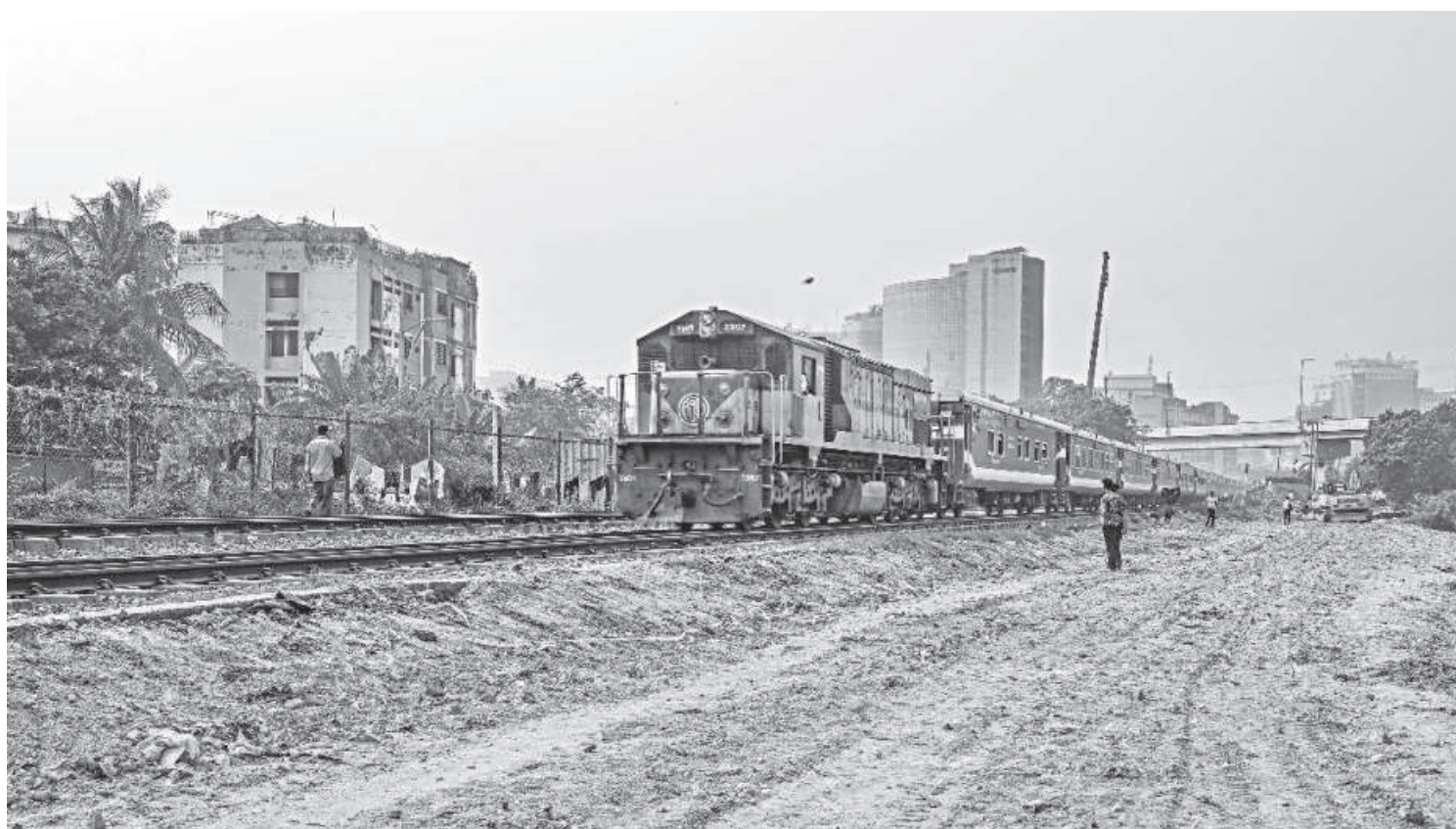
Workers are levelling the ground by the rail track in Tejgaon area for the construction work of the elevated expressway. This photo was taken yesterday.

Many war researchers, however, said the total number of martyred intellectuals could be much higher. The members of Buddhijibi Nidhan Tathyanusandhan Committee, set up in 1972, had made a primary list of 20,000 intellectuals who were killed.