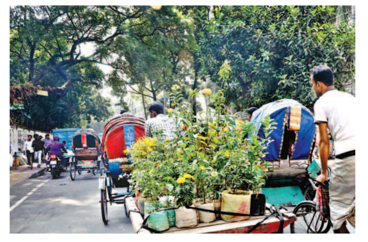
In the advent of winter, the demand for flowering plants has increased. To meet this demand, vendors have been moving from one place to another, carrying such plants on vans to attract potential customers. This photo was taken in Kataban yesterday.