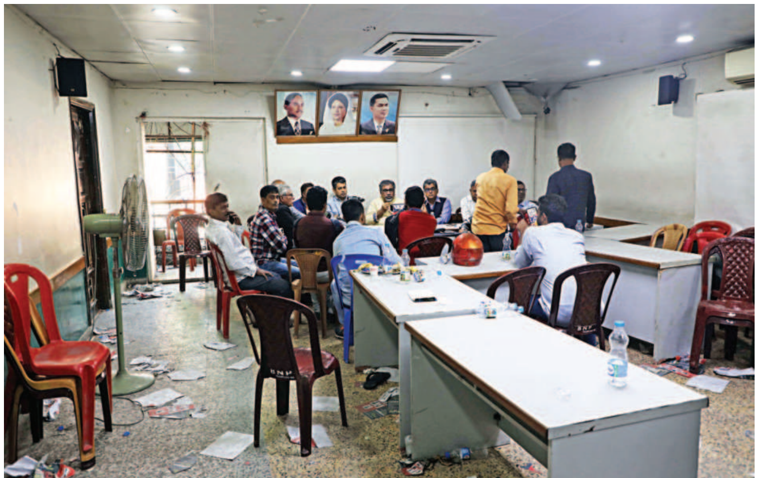
BNP leaders and activists in a meeting at the party's Nayapaltan office yesterday afternoon. The office reopened after four days, as all the barricades were removed from the road in front of the office after the party's Dhaka rally on Saturday. The office had remained locked since Wednesday's clash between BNP men and police, which left one dead and at least 50 injured. Since then, law enforcers didn't allow anyone to enter the office.