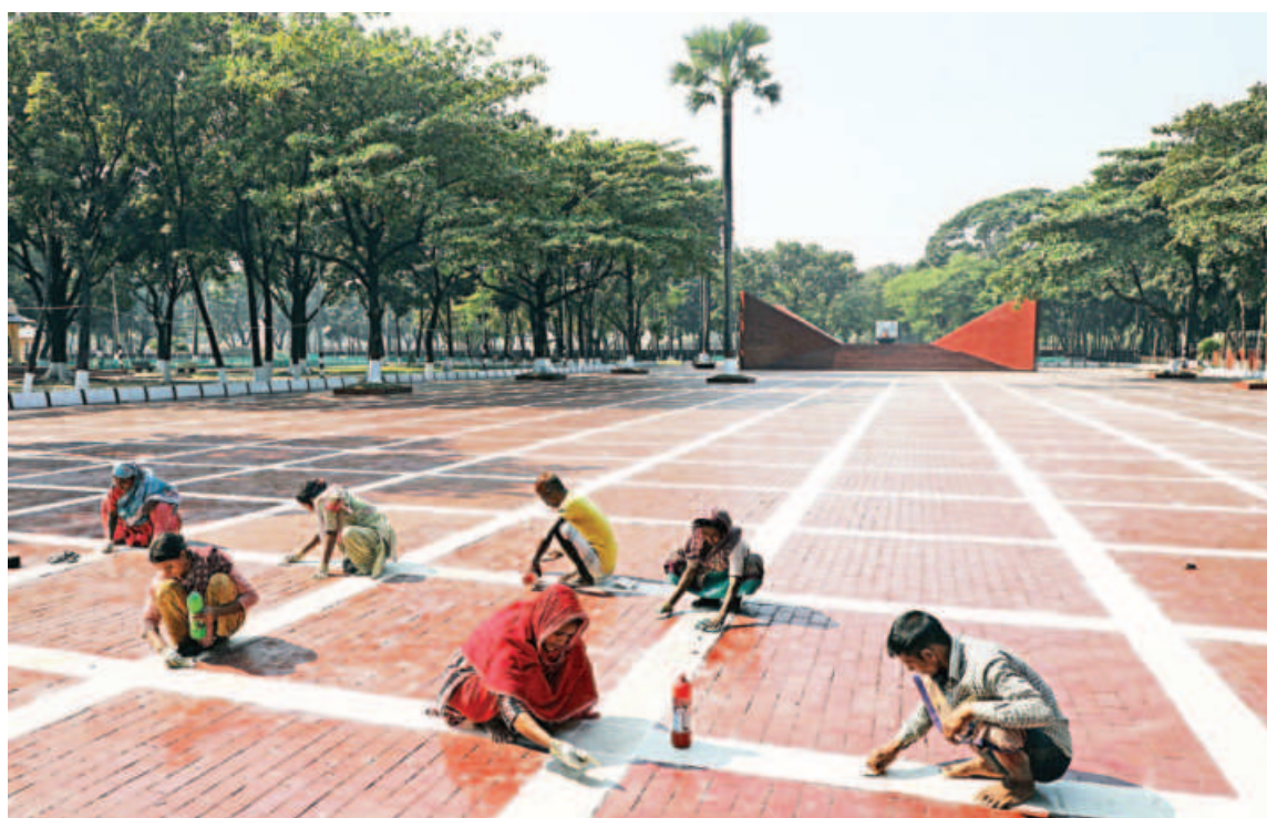
Workers cleaning Martyred Intellectuals Memorial in the capital's Mirpur yesterday, ahead of the Martyred Intellectuals Day to be observed on December 14. On the day, people from all walks of life visit the memorial to mourn and pay respect to the intellectuals killed by the Pakistan occupation army at the fag end of the 1971 Liberation War.