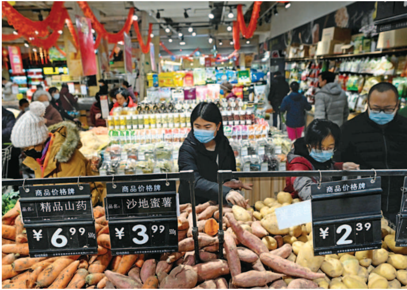
People select vegetables at a supermarket in Beijing. China's consumer inflation slowed in November as it fell below 2 per cent for the first time since March.

China has been relatively unaffected by a global surge in food prices since Russia's invasion of Ukraine in February.