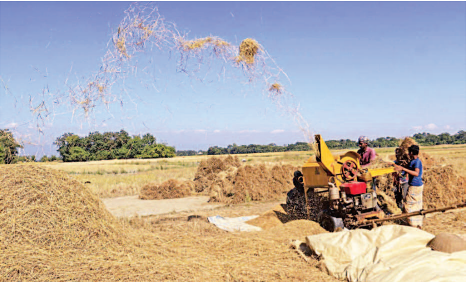
Farmers harvesting ripe Aman and threshing the paddy on a field in Sylhet’s Companiganj upazila yesterday. With the arrival of early winter came the Aman harvest and the farmers are happy with this year’s yield. After threshing, they will collect the wheat in bags and take them back home.

Around two hours before the exam, the recruitment process was suspended as the question paper was allegedly leaked.