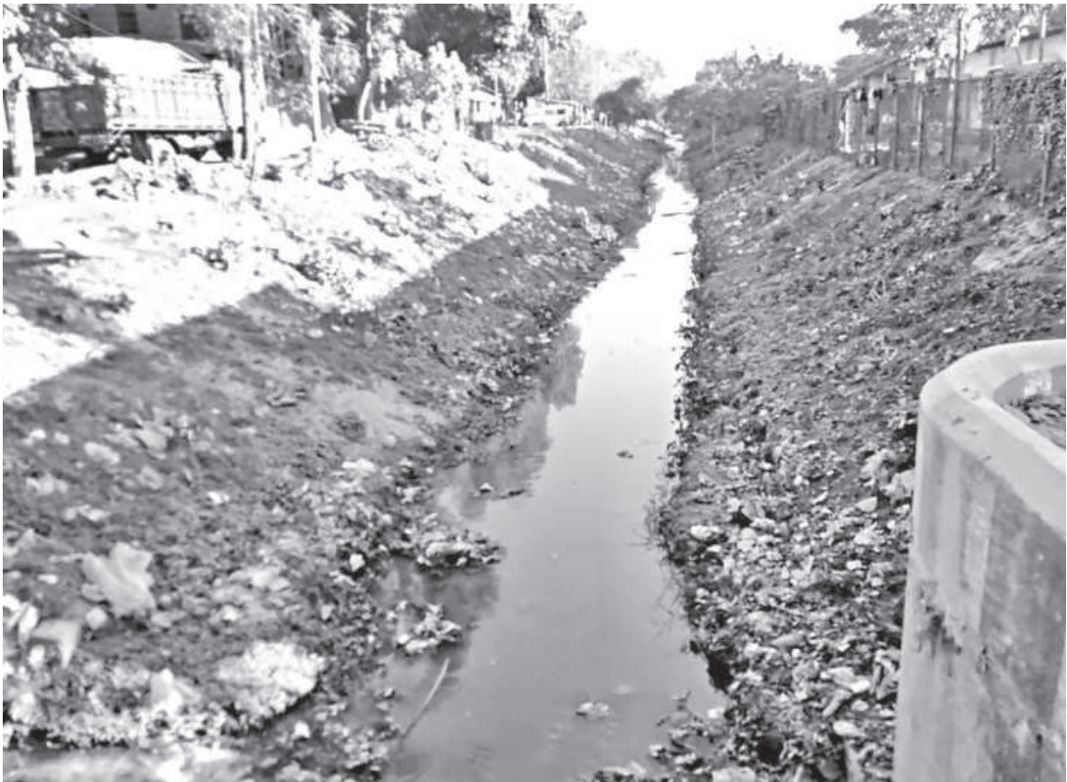
The once 16-km long and 100 feet wide Maharani Shyamasundari canal has turned into a drain due to rampant dumping of garbage and encroachment. The canal has also become a breeding site for mosquitoes. This photo was taken recently.