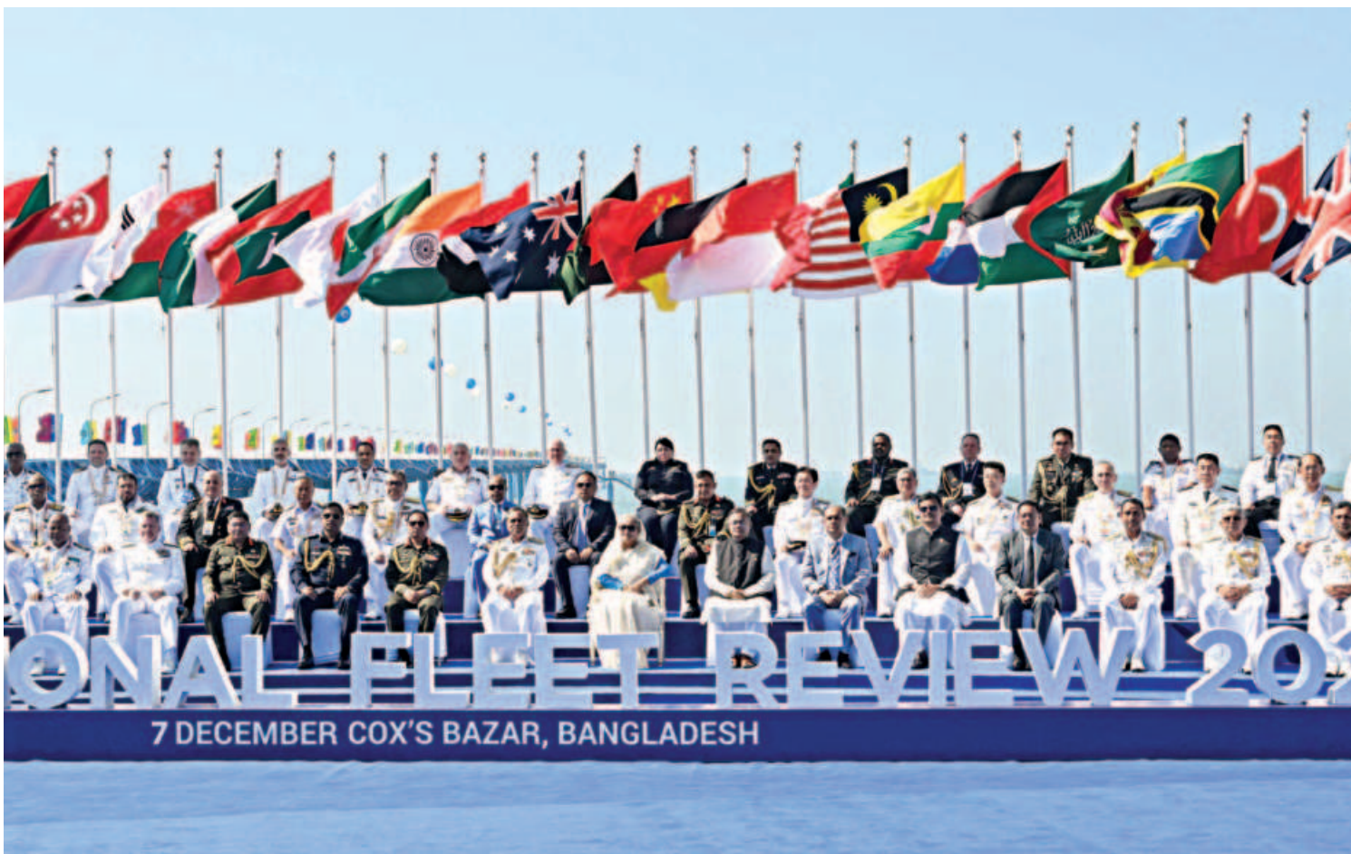
Prime Minister Sheikh Hasina inaugurated the International Fleet Review-2022 at Inani in Cox's Bazar yesterday. The four-day event is being organised by Bangladesh Navy with the title "Friendship Beyond the Horizon". Navies and maritime organisations from 28 countries, including the US, UK, Germany, Italy, Saudi Arabia, India, China, Korea, Indonesia, Malaysia, Myanmar, Thailand, Turkey, the Netherlands and host Bangladesh, are participating in the event.