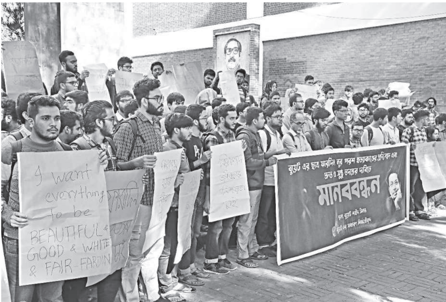
Students of Buet hold a rally in front of the Shaheed Minar on the campus yesterday, demanding fair probe and immediate arrest of the perpetrators behind Fardin murder.

At the human chain, the Buet students demanded immediate arrest of the perpetrators and a fair probe.