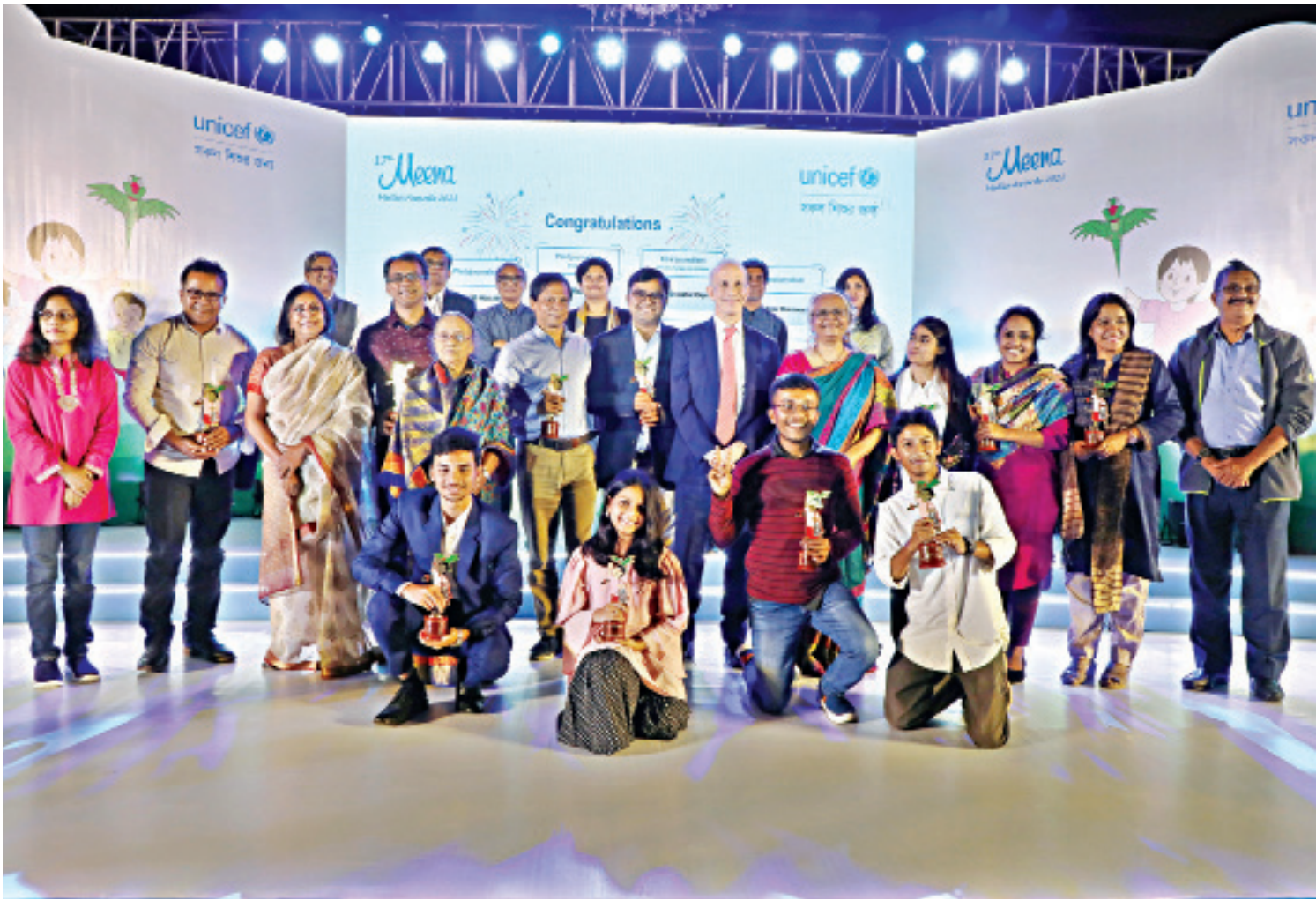
Eleven journalists were honoured with the Unicef Meena Media Award for reporting on child rights yesterday. The award-giving ceremony was hosted by Unicef Bangladesh at a city hotel.