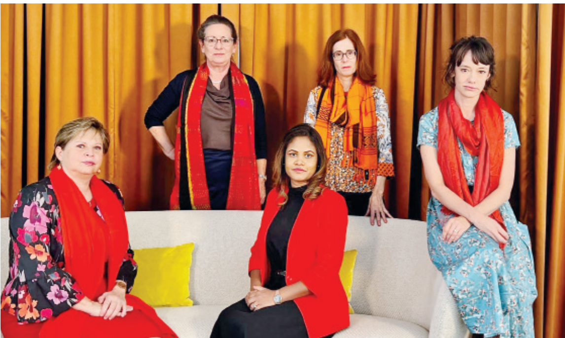
Lilly Nicholls, high commissioner of Canada; Winnie Estrup Petersen, ambassador of Denmark; Shiruzimath Sameer, high commissioner of the Republic of Maldives; Alex Berg von Linde, ambassador of Sweden, and Nathalie Chuard, ambassador of Switzerland, recently met to express solidarity with the 16 days of activism against gender-based violence. With a strong commitment to gender equality, the female ambassadors and high commissioners in Dhaka also asked all to join them in the campaign (November 25 to December 10) to end gender-based violence. See related article on Page 8.