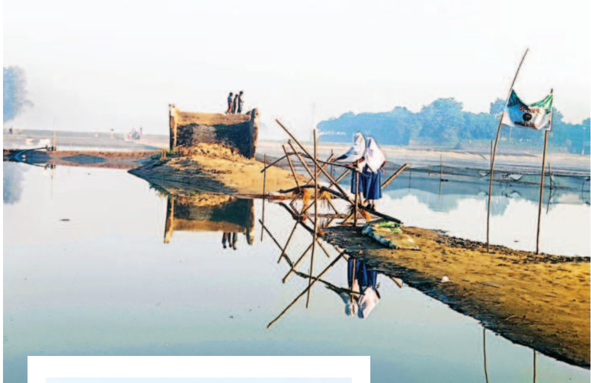
School students cross a bamboo bridge in Sarail, Brahmanbaria, with a half-built concrete one right next to it. The incomplete bridge has been in this state for 27 years as the authorities concerned have taken no initiative to complete it. Locals have long been saying that their commutes would be much easier if the bridge was functional.