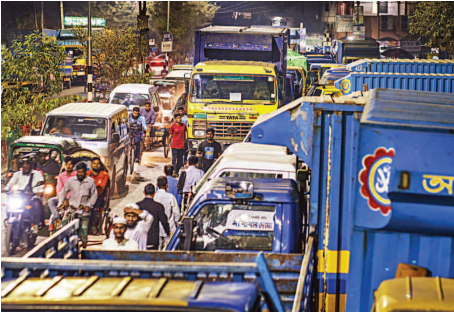
Despite the Tejgaon truck stand situated close by, truckers choose to illegally park their vehicles on the Mayor Anisul Haque road in the capital, causing traffic jams in the area every day. The photo was taken yesterday.