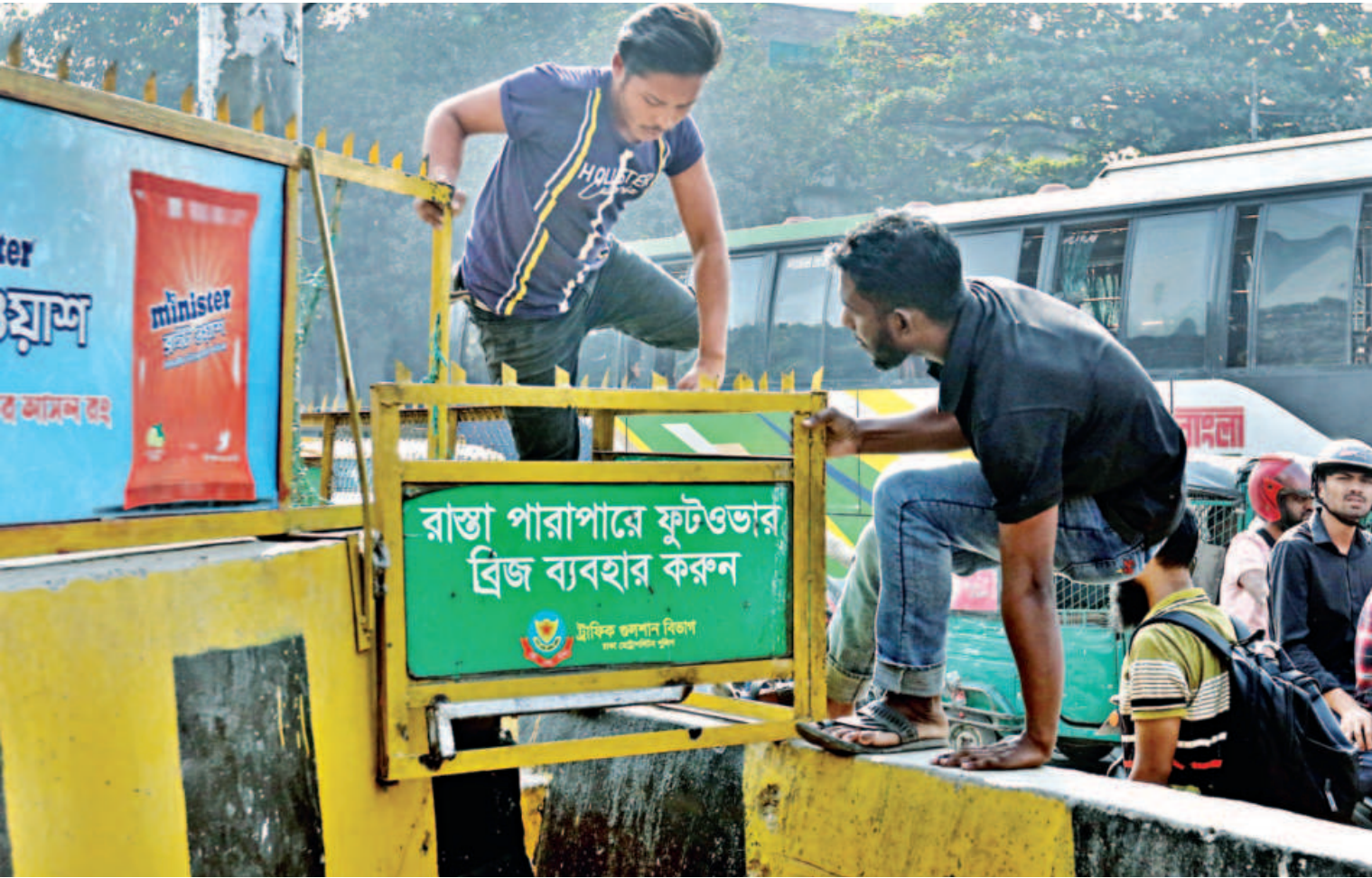
Apparently warning sign means nothing to these two, as they climb over it to cross this busy road at Mohakhali intersection, despite a foot-over bridge being only 25 to 30 yards away. Such way of jeopardising one's life just to save seconds have become a common sight on Dhaka roads. This photo was taken recently.