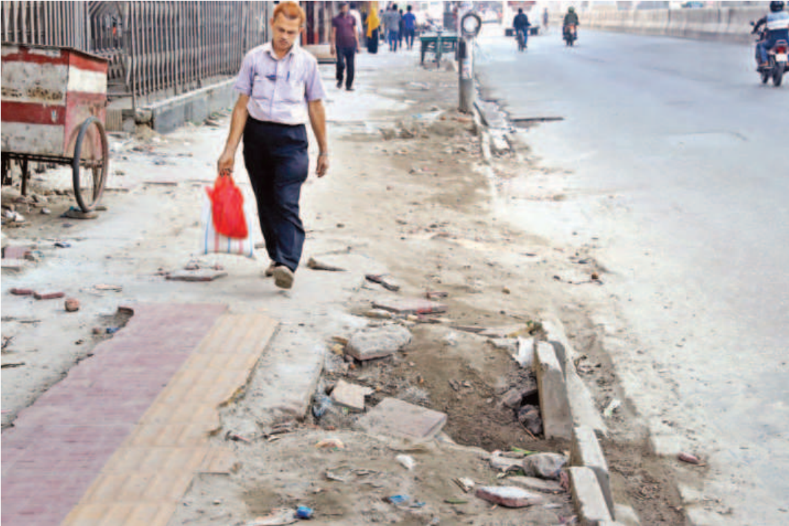
Cautious, a pedestrian walks on a dilapidated portion of the footpath next to Kazi Nazrul Islam Avenue. Numerous potholes have developed on the entire stretch of this busy walkway, while the authorities concerned continue to turn a blind eye. This photo was taken recently.