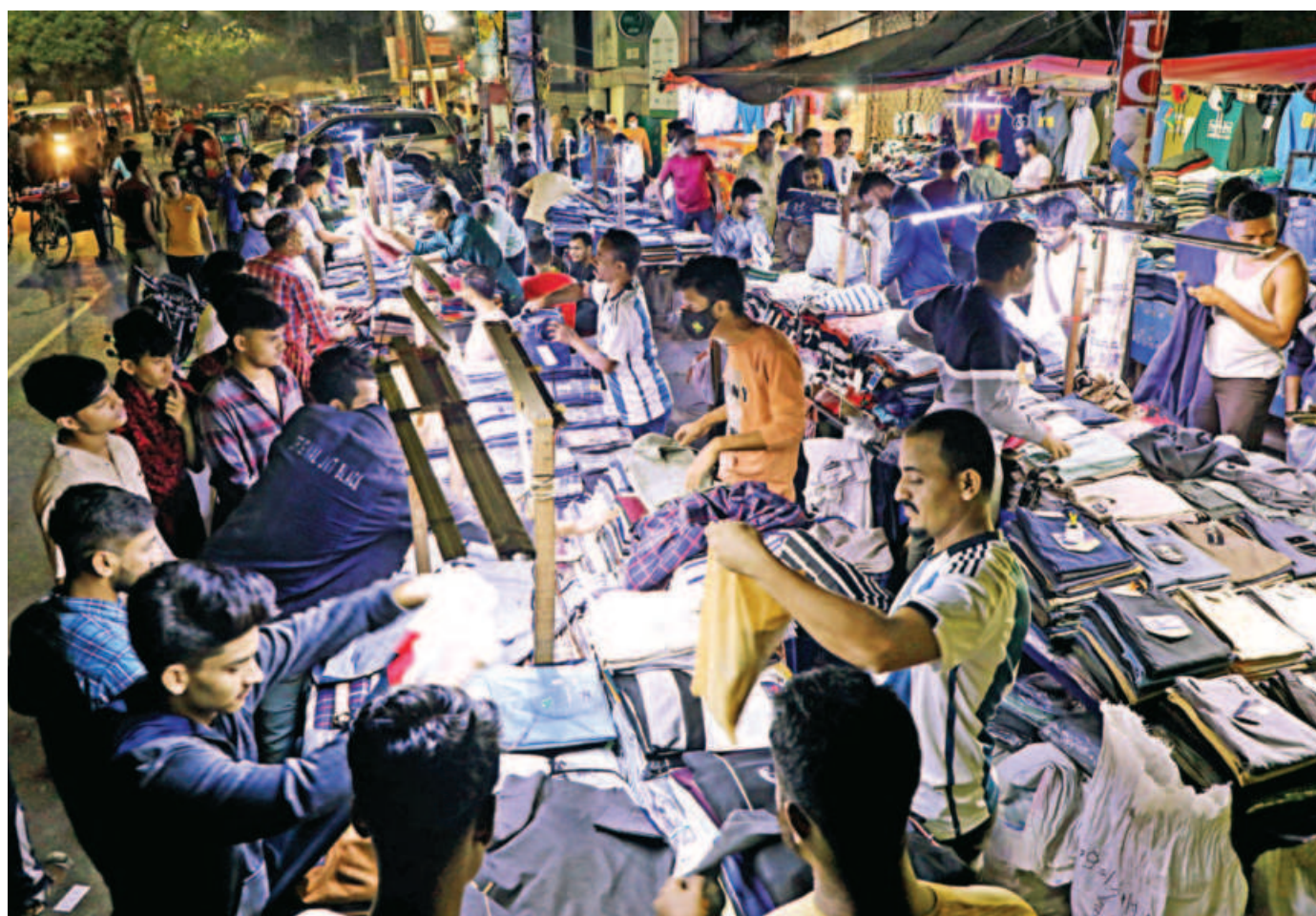
Sellers of warm clothes are enjoying a brisk trade as the temperature dropped a little over the last week. The photo was taken on Ring road in the capital's Mohammadpur.