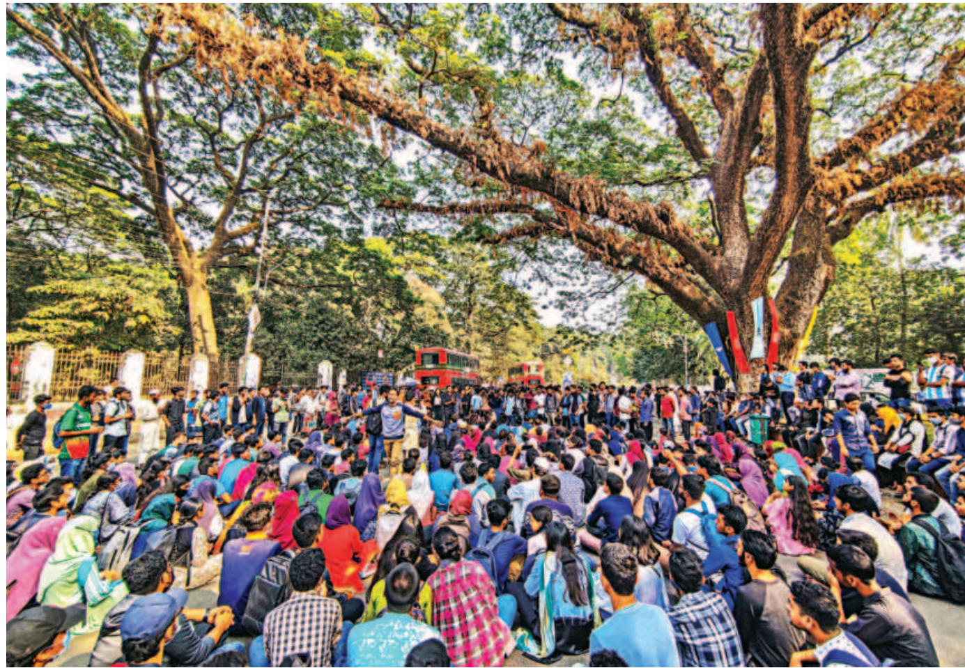
Dhaka University students demonstrating on campus for safer roads yesterday, two days after a motorist dragged a woman under his car through the campus, causing her to die.