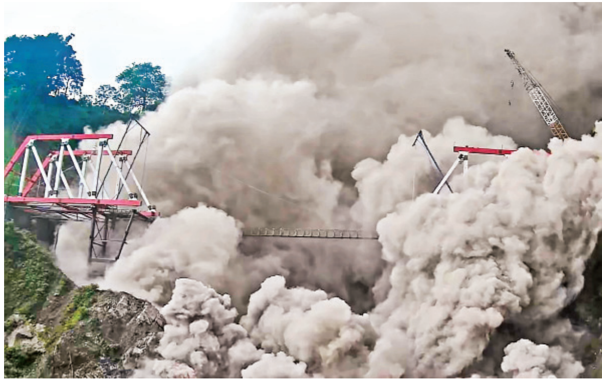
This handout photo taken and released from the Indonesia Geology Agency yesterday shows the Glada Perak bridge hit by hot smoke and ashes from the Mount Semeru volcano eruption in Lumajang. The volcanic eruption spewed a cloud of ash 15 km into the sky and forced the evacuation of nearly 2,000 people, authorities said, as they issued their highest warning for the area in the east of Java island.

The army said a few hours later it had targeted a Hamas military post in response to fire from the Gaza Strip against Israeli warplanes.