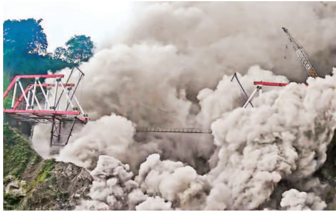
This handout photo taken and released from the Indonesia Geology Agency yesterday shows the Glada Perak bridge hit by hot smoke and ashes from the Mount Semeru volcano eruption in Lumajang. The volcanic eruption spewed a cloud of ash 15 km into the sky and forced the evacuation of nearly 2,000 people, authorities said, as they issued their highest warning for the area in the east of Java island.

The army said a few hours later it had targeted a Hamas military post in response to fire from the Gaza Strip against Israeli warplanes.