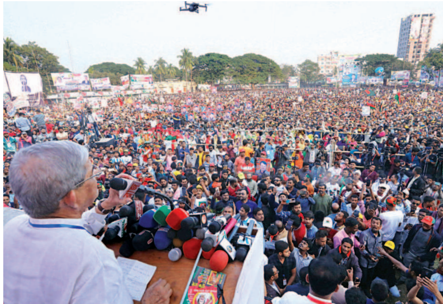
BNP Secretary General Mirza Fakhru Islam Alamgir addressing a mammoth rally at Madrasa Maidan in Rajshahi city yesterday. Thousands of people joined the divisional rally from eight districts. Fakhru urged his party men to join the Dhaka divisional rally on December 10.