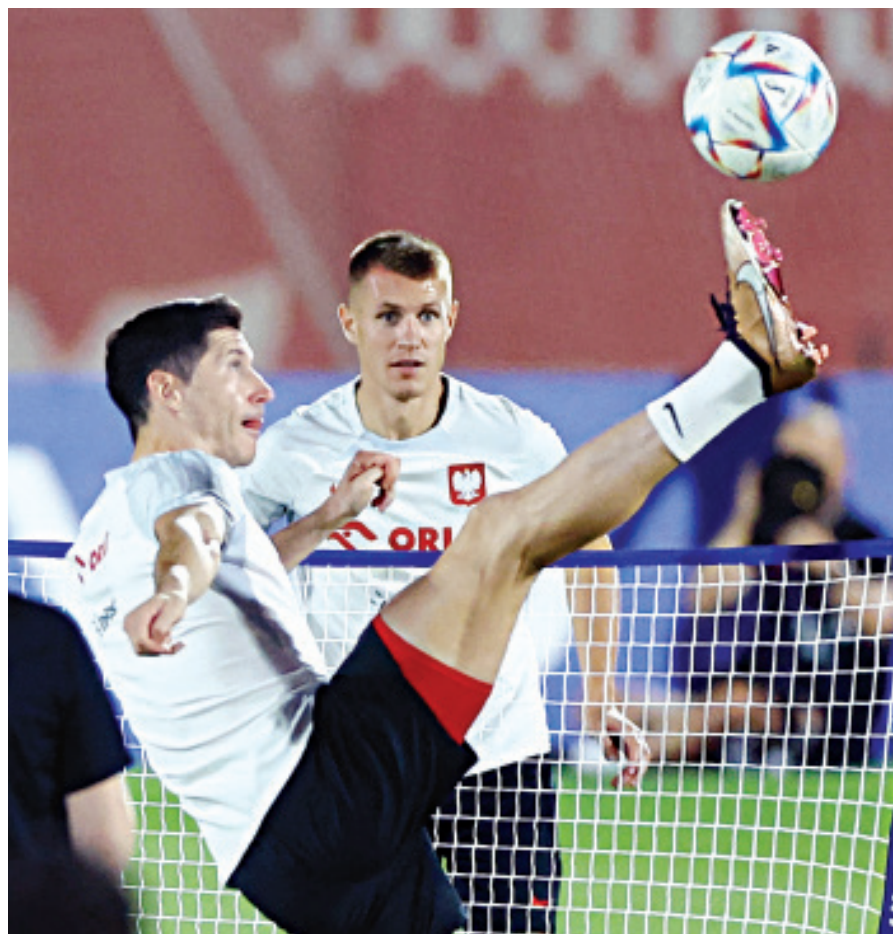
Robert Lewandowski (L) is a deadly weapon up front for Poland but much of his side's chances against the defending champions France will depend on how they neutralise Kylian Mbappe (R) and company in the two side's round of 16 encounter at the Al Thumama Stadium tonight.

"Senegal will be tough," he said. "They're very well organised, they've got a lot of good individual players playing in big European leagues and their expectations now will rise."