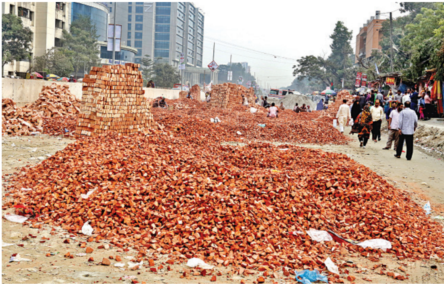
Brick chips are piled up on one side of the road beside Dhaka Shishu Hospital as development work goes on. As a result, vehicles pass from both directions on the other side of the road, resulting in traffic congestion, much to the dismay of patients and their attendees. This photo was taken recently.