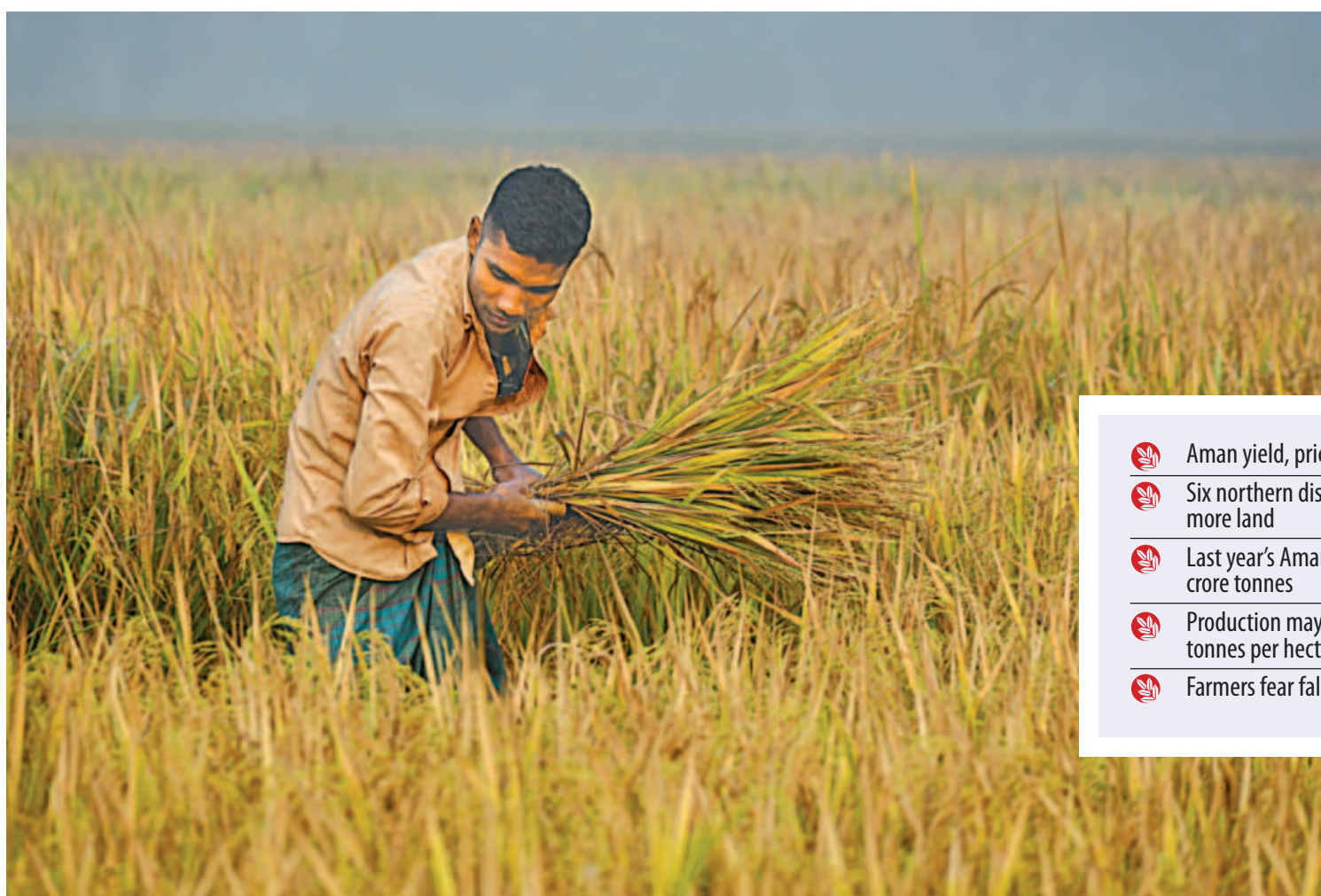
A farmer harvesting Aman paddy in Bogura's Shajahanpur upazila. Growers in six northern districts are happy to have a bumper crop and good price this year. The paddy is being sold for Tk 1,200-1,800 per maund depending on the variety. The photo was taken recently.