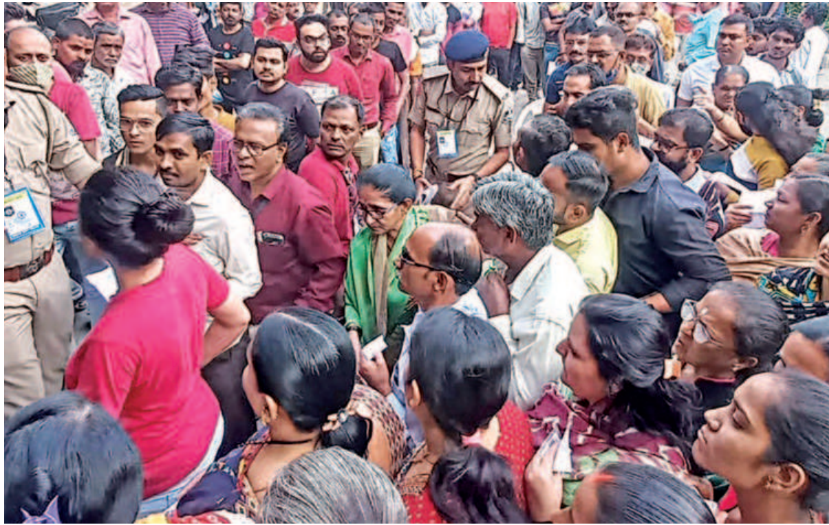
People wait outside a polling station to cast their vote during Phase 1 of Gujarat's assembly elections in Surat, India yesterday. Indian Prime Minister Narendra Modi's home state of Gujarat began voting yesterday with his Hindu nationalist party expected to win a seventh straight term, but any unexpected slip could herald a tighter contest in national polls due by 2024.

Natural and man-made catastrophes have caused $268 billion of economic losses so far in 2022, chiefly driven by Hurricane Ian and other extreme weather disasters, reinsurance giant Swiss Re estimated Thursday. Of the estimated $268 billion total economic losses for property damage so far this year, $260 billion are from natural catastrophes and $8 billion from man-made disasters, such as industrial accidents. The $268 billion figure is down 12 percent from $303 billion last year, but above the $219 billion average over the previous 10 years. At $115 billion, total insured losses from natural catastrophes were down five percent from the $121 billion in 2021, but well above the previous 10-year average of $81 billion.